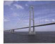
World Record for Spinning Spanning the Great Belt: Denmark's East Bridge