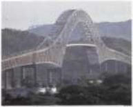
Connecting what the waters once divided Panama: Bridge of the Americas / Puente de las Américas