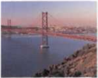
Symbol of the Revolution of the Carnations Lisbon: Ponte de 25 Abril