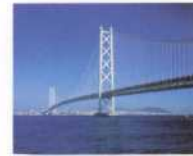
Tempting Fate Kobe: Akashi Kaikyo Bridge