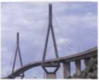
A Triumphant Arch in the Port of Hamburg Hamburg: The Köhlbrand Bridge