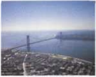
In harmony with the magnificent landscape New York: Verrazano Narrows Bridge