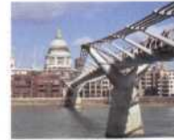
A blade of light across the Thames London's Millennium Bridge