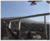
For Peace and Unity Innsbruck: The “Europabrücke”