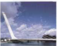
For Expo '92 Seville: Alamillo Bridge