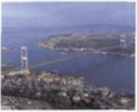
The Gateway to the East Istanbul: Bosphorus Bridge (Bogaziçi)