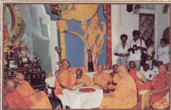
X: FELICITATION AND AWARDS