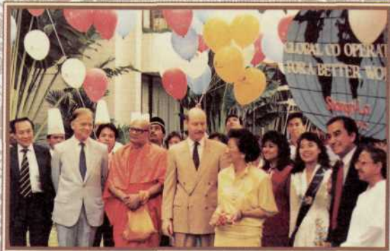
VIII: INTER-FAITH ACTIVITIES