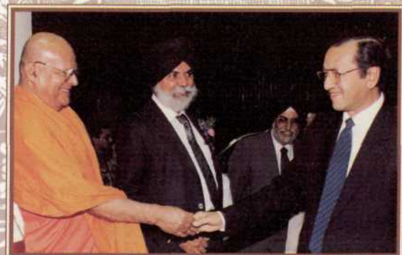
IX: MEETING WITH POLITICAL LEADERS