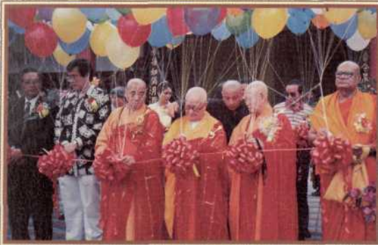
VI: REACHING OUT TO THE MALAYSIAN BUDDHIST COMMUNITY