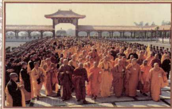
VII: ON THE INTERNATIONAL FRONT