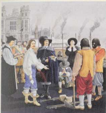
1649 • Death for Charles I – and Britain without a monarch for 11 years