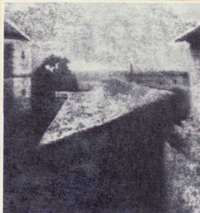
1827 • The birth of photography, a new recorder of events and everyday life