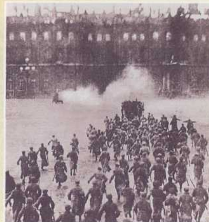
1917 • Revolution in Russia, the start of Communism's 74-year tyranny