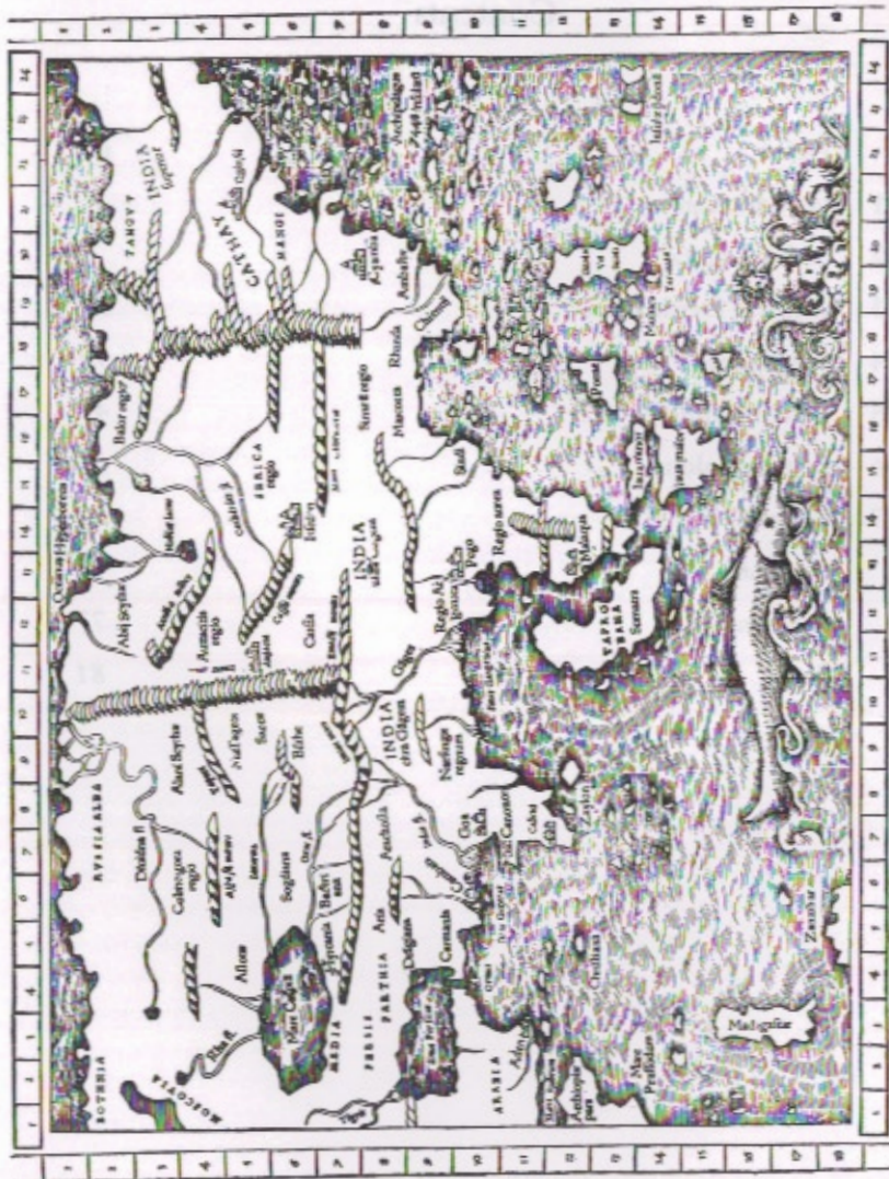
1. 'India Extrema Nova Tabula', by Sebastian Münster, c.1552. (Antiques of the Orient)