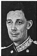
Sir Donald McGillivray

The night of the eve of Merdeka is worth recalling for it was a night of happiness and rejoicing not only for Malaysians but for her friends all over the world. The end of British rule was near—an era which lasted for more than 170 years.