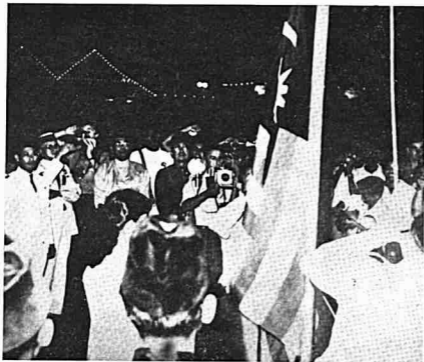
Mid-night Flag Raising Ceremony on 30th August, 1957, to mark the birth of the new nation.

At exactly twelve midnight, the Chief Minister and Prime Minister designate, Tunku Abdul Rahman, led a mammoth crowd at the Selangor Club padang in front of the Secretariat to witness and rejoice the birth of a new nation. Addressing the crowd, the Tunku said: