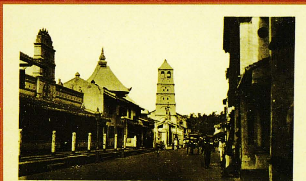
THREE TEMPLES MALACCA