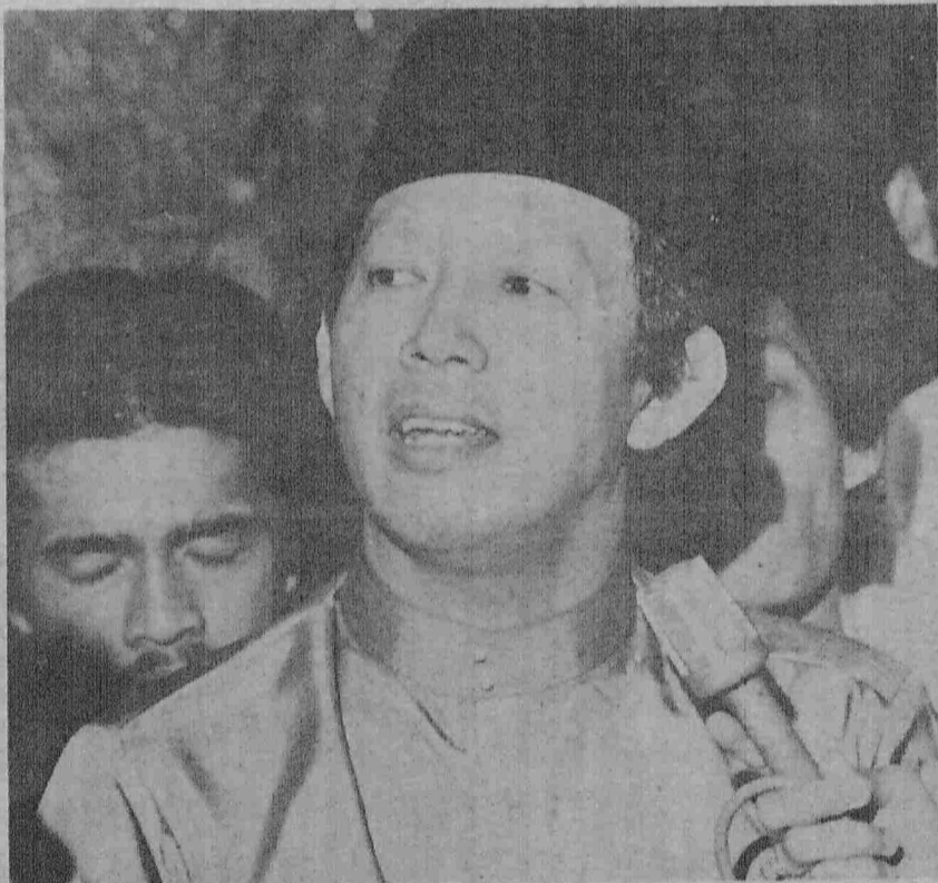
Datuk Musa speaking to reporters after he was declared the new Umno deputy-president

KUALA LUMPUR, Fri. — Datuk Musa Hitam, who entered politics in 1964 when he accepted the post of political secretary to the then Minister of Transport, Tun Sardon Jubir, has the distinction of serving under three Prime Ministers so far.