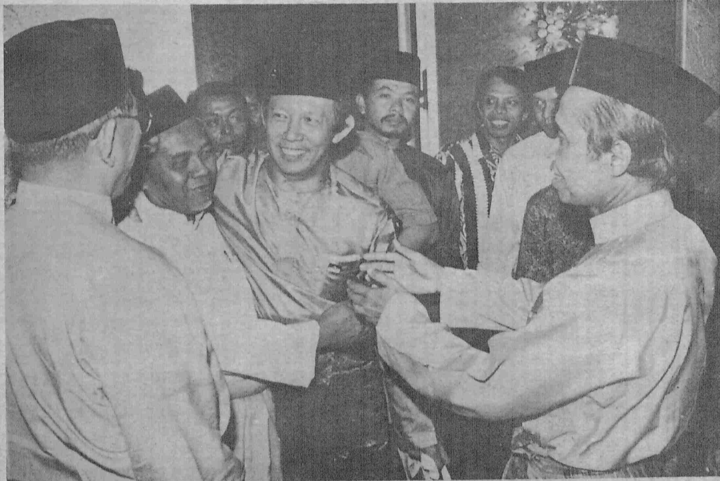
Supporters congratulating Datuk Musa after the result of the contest for the deputy-presidency was announced