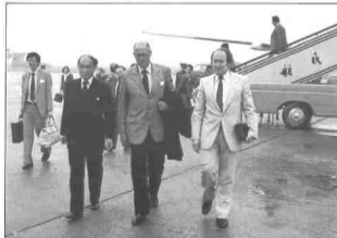
Dr J Havelange, FIFA President and Mr J S Blatter, FIFA General Secretary arrive in Guangzhou, China PR with Dr Henry Fok for the 11th AFC Congress. 1984

In this decade we have not only forged cordial relationship with our affiliates, but have also established excellent working relationship with FIFA who have rendered very valuable assistance especially for development activities. We continue to receive special interest and attention from Dr Joao Havelange and Mr J S Blatter in all our activities as well as their attendance at all our Congresses.