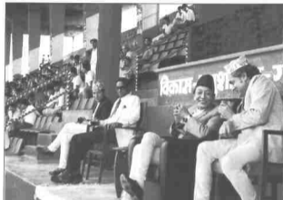
AFC general Secretary's visit to Nepal