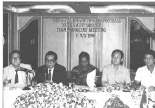
AFC General Secretary's visit to Thailand

organisational skills of our National Associations to professional standards. All the AFC and FIFA Tournaments are extremely well organised and their success is a matter of pride.