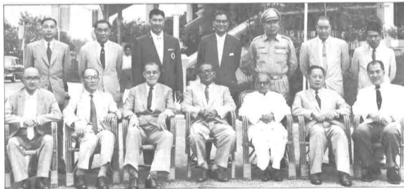
AFC Executive Committee 1957.