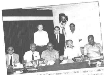
The Afro-Asia Consultative Committee meets often to discuss matters of mutual interest affecting both the African and Asian Confederations. The photo shows members of the Committee at a meeting in Abidjan, Ivory Coast in March 1984.