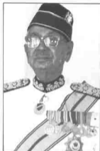
TUNKU ABDUL RAHMAN PUTRA AL-HAJ (HON. PRESIDENT AFC)