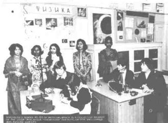
Specialised School No. 83 of Moscow, which is a collective member of the USSR-Malaysia Friendship Society, often welcomes Malaysian guests.

We shall always remember our meeting with Malaysia's Former Prime Minister, Tun Hussein Onn who was warmly welcomed by our pupils in the Friendship House during his official visit to the Soviet Union in September 1979. This visit was a momentous event illustrating our countries' sincere wish to develop good relations. We are proud that our school is making a contribution of its own to the development of Soviet-Malaysian cooperation and to the consolidation of mutual understanding and friendship between our nations.