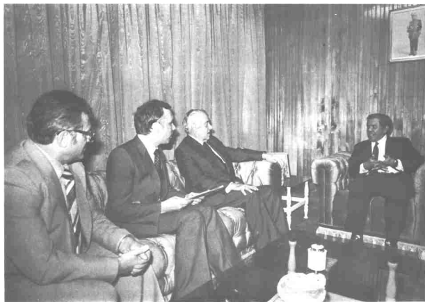
Meeting in the Ministry of Foreign Affairs of Malaysia.

The USSR Deputy Foreign Minister Nikolai Firyubin also met Malaysia's Deputy Minister of Trade and Industry Da-