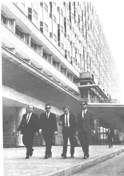
Malaysian Trade Delegation in Moscow.

The developing countries of South-East Asia hold a notable place in the system of the USSR's external economic ties. The Soviet Union's trade with the countries of South-East Asia has a history of many years.