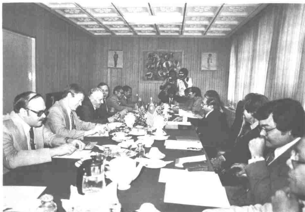
During the Soviet-Malaysia Consultations.