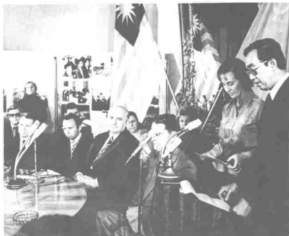
Left and Right: The meeting to celebrate Malaysia National Day in the Moscow Friendship House.

'We attach great importance to our cooperation with the