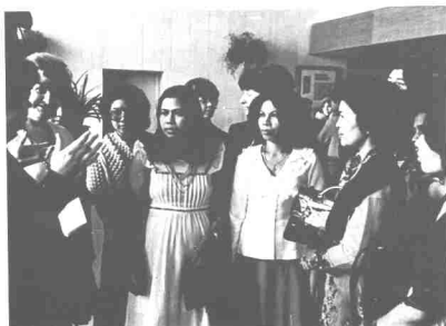
Malaysian women attending Ashkhabad cinema, which is a collective member of the USSR-Malaysia Friendship Society.