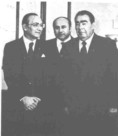
During his visit to the USSR in September 1979, Prime Minister Datuk Hussein Onn had a talk with Leonid Brezhnev, General Secretary of the CPSU Central Committee, President of the USSR Supreme Soviet.

The visits to the Soviet Union of Prime Minister Tun Abdul Razak in 1972 and that of Prime Minister Datuk Hussein bin Onn in 1979 were also of paramount importance for Soviet-Malaysian cooperation. The talks of the leaders of the two countries showed the proximity of the Soviet and Malaysian outlook on a number of key international issues concerning entire humanity. First of all this refers to the issues of securing peace and preventing the nuclear missile war, disarmament and development of equal international cooperation.