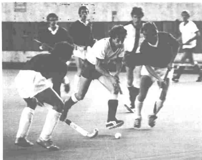
The USSR field hockey national team in action.

were the final. It is probably this determination along with the ability to stick to collective play even in the most difficult situations that have enabled the Soviet team to outplay New Zealand and Malaysia. The hosts have appealed to me with their swift and determined play. It was with monumental efforts that the Soviet side managed to snatch the victory in the decisive game against Malaysia, after our boys had succeeded in breaking Malaysia's regular play-links by marking the best Malaysian players out of the game thus taking over the initiative.