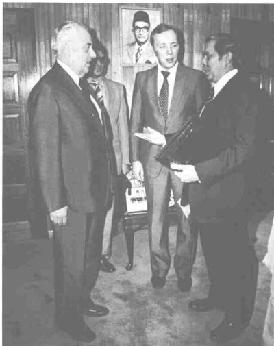
Deputy Foreign Minister Nikolai Firyubin paid a visit to the then Malaysian Foreign Minister, Tengku Ahmad Rithauddin.