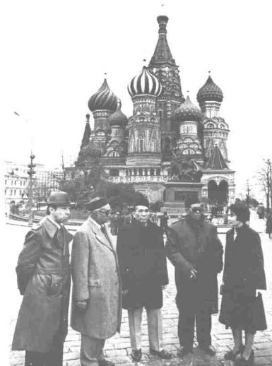
Members of the Malaysia-USSR Society delegation in Moscow.

Today we wish all friends of the Soviet Union in Malaysia fresh success in their noble effort of strengthening friendship and cooperation between the two nations.