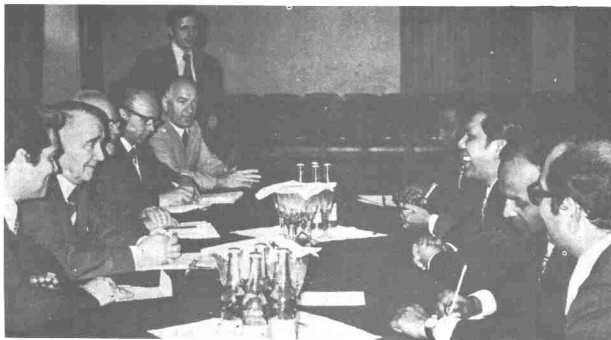
In 1973 Tengku Ahmad Rithauddin, then Minister of Information and Special Functions in Foreign Affairs (now Minister of Trade and Industries) of Malaysia had talks with S.A. Skachkov, Chairman of the USSR State Committee for Foreign Economic Relations.