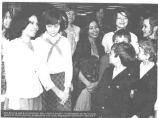
Malaysian guests visiting Moscow's schoolchildren.