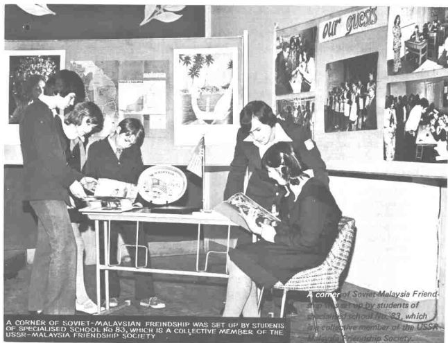
A corner of Soviet-Malaysia Friendship is set up by students of specialised school No. 83, which is a collective member of the USSR-Malaysia Friendship Society.