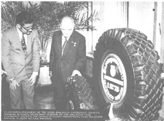
V.S. FEDOROV, PRESIDENT OF THE USSR-MALAYSIA FRIENDSHIP SOCIETY, SHOWING M. YUNUS, SECRETARY-GENERAL OF THE MALAYSIA-USSR FRIENDSHIP SOCIETY, THE OBJECT OF SOVIET ENTERPRISES USING MALAYSIAN NATURAL RUBBER AS RAW MATERIAL.

machine tools, mechanical equipment, pharmaceutical and other consumer goods can find a market in Malaysia.