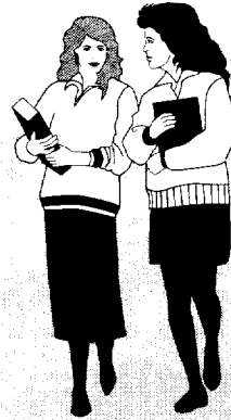
IPTA: Public Institutions of higher learning.