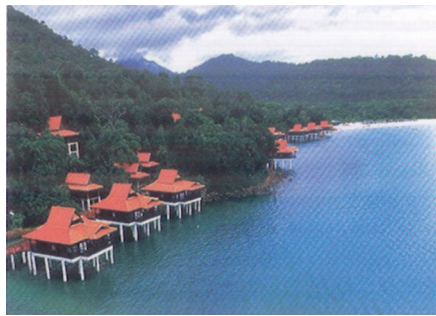
One of the many resorts in Langkawi

Langkawi is famous for two international events, the 'Langkawi International Maritime and Airshow' (LIMA) held every two years and 'Le Tour de Langkawi' an international cycling event also held every two years. Starting in Langkawi cyclists then cycle throughout the country. These two events have put Langkawi and Kedah on the world sporting and tourism events list.