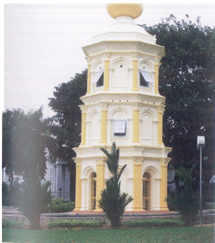
Balai Nobat, Alor Setar

Or for that matter the Bujang Valley, the ancient Hindu-Buddhist civilization, an area that stretches from the foothills of Gunung Jerai to Kuala Muda in the south. Over 50 archaeological sites containing the ruins of Hindu and Buddhist temples have been unearthed and displayed at the Bujang Valley Archaeological Museum. The only recognition from UNESCO is that one of the islands in Langkawi was accorded the Global Geopark status for its unique geological structures. It is not enough to accord Alor Setar, the oldest city in Malaysia with a long history and a rich heritage, with the oldest Sultanate in Malaysia that is continuous for eight centuries, with just a city status. It should be accorded the UNESCO World Heritage site too. The authorities in Kedah should urge the Federal Government to do something about it with UNESCO. Kedah, the Malay heartland of Malaysia, deserves a better place in modern history despite its ancient origins.