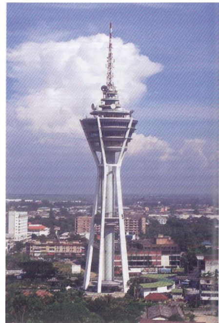
Alor Setar Tower

Menara Alor Setar (Alor Setar Tower) is a modern landmark in the heart of Alor Setar. This 165.5 metre tower is Malaysia's second tallest communications tower and is a tourist attraction. Set in the city centre, the tower offers panoramic views of Alor Setar and the surrounding padi fields, mountains, rivers and sea. There is also a revolving restaurant and a viewing gallery.