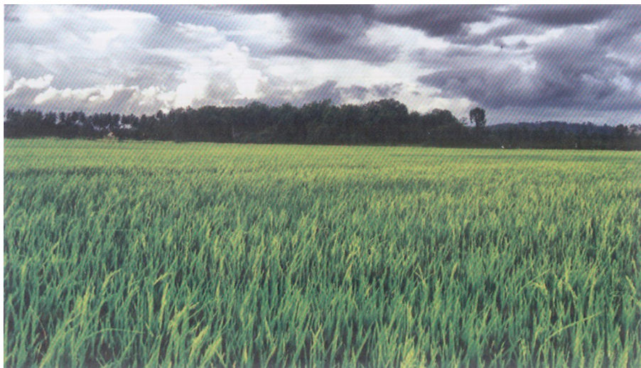
Vast fields of padi

'Selamat Datang ke Negeri Kedah - Jelapang Padi Malaysia' (Welcome to Kedah - Rice Bowl of Malaysia) is the sign that greets visitors entering the State of Kedah overland through its western border with Penang.