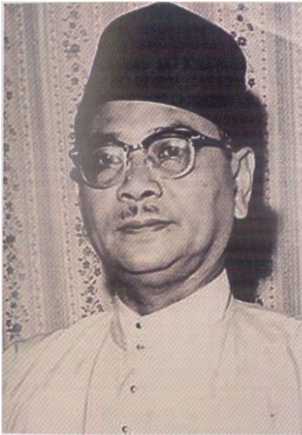
Tunku Abdul Rahman

If you drive through Alor Setar today you can't help being caught in the traffic congestion in the city centre as they are building a new electrified double-tracking railway track that will connect Kedah to Thailand. I believe this is part of the Trans-Asia railway project that will eventually link Singapore to Kunming in China, running throughout Peninsular Malaysia, an idea by former Premier Tun Dr Mahathir Mohamad. Alor Setar is also connected by rail to Bangkok, operated by the State Railway of Thailand. And not to forget, the Eastern Et Oriental Express runs from Bangkok through Peninsular Malaysia to Singapore, an experience many tourists find fascinating.