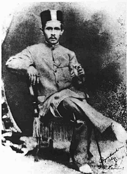
H.H. Sultan Ahmad al-Mu'azzam Shah ibni Bendahara Wan Ali, Bendahara Sri Wak Raja 1863-1882, Sultan of Pahang, August 1882-1914, taken in about 1880.