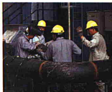
Construction and engineering