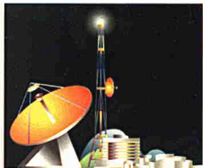
Media and telecommunications

Underneath it all, we are a company driven by forces of ideas and knowledge to meet challenges of the future.