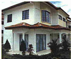
Property development and investment

Over the years, Malaysian Resources Corporation Berhad (MRCB) has grown with Malaysia. Today, after our transformation from a modest public listed company, we are one of the fastest growing and diversified corporation in Malaysia.