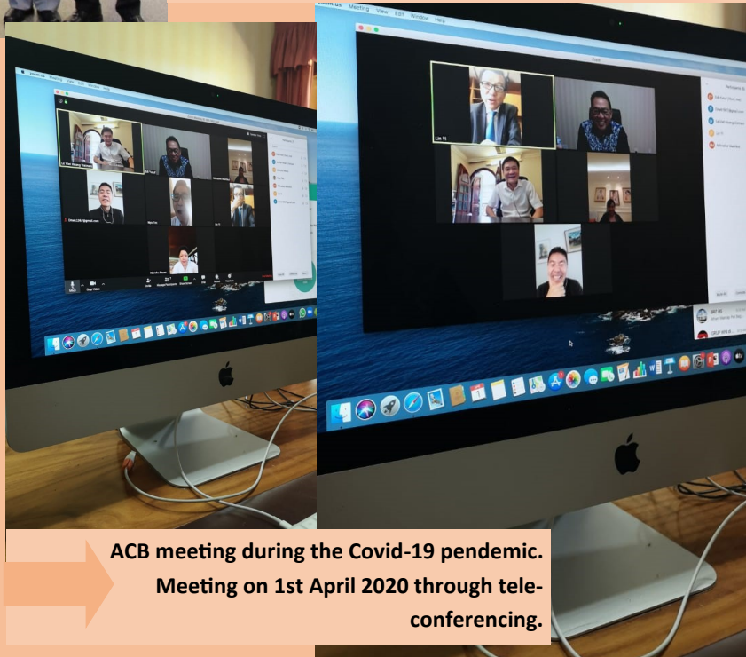
ACB meeting during the Covid-19 pandemic. Meeting on 1st April 2020 through teleconferencing.