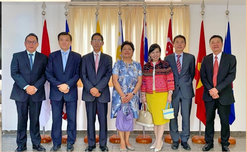
1st ACB Meeting under the chairmanship of the Embassy of Myanmar.