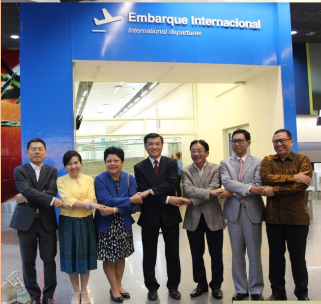
Sending off the departing Ambassador of the Socialist Republic of Vietnam to Brazil.