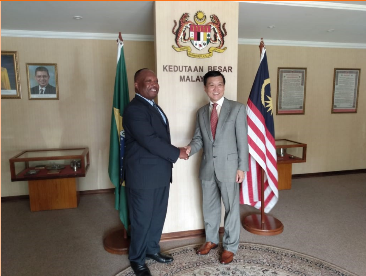
Courtesy Call by the Ambassador of the Republic of Zimbabwe.