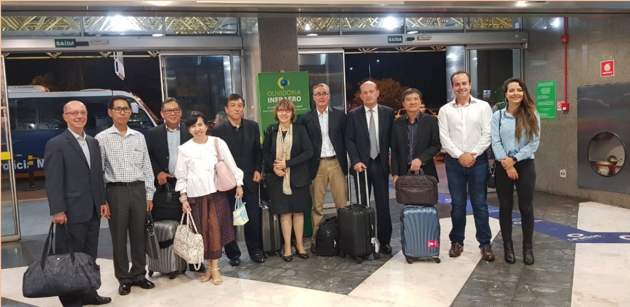
At the arrival gate of the Marechal Rondon International Airport, Mato Grosso Do Sul during a visit to the state on 14-15 February 2020.