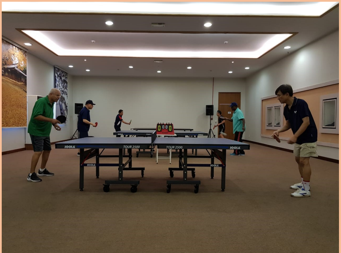
Diplomatic Ping Pong... weekend drilling with the other Ambassadors at the Embassy of South Korea.