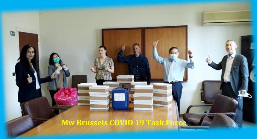
Mw Brussels COVID 19 Task Force