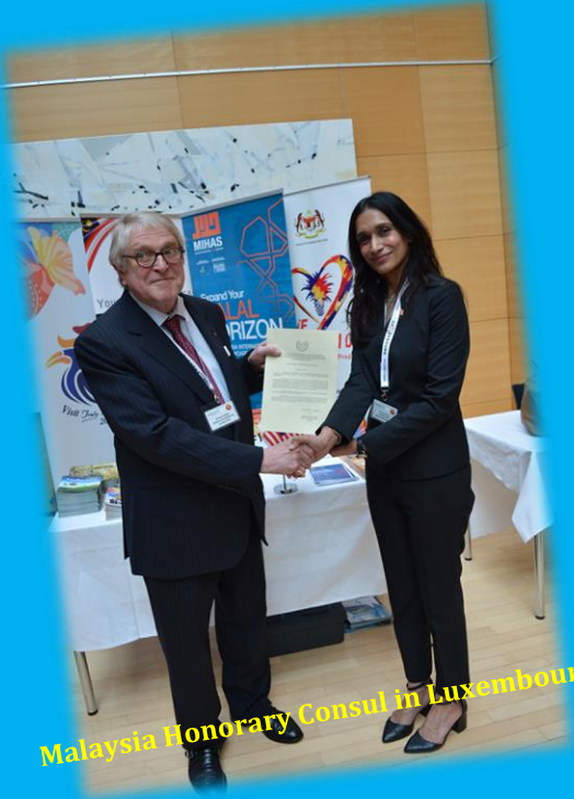
Malaysia Honorary Consul in Luxembourg