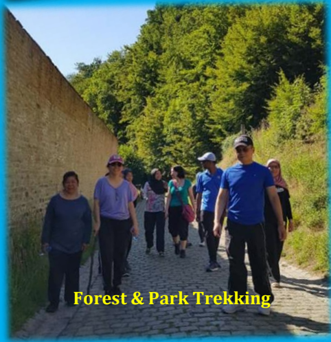
Forest & Park Trekking