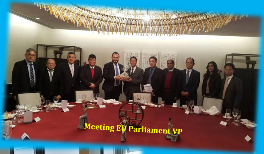
Meeting EU Parliament VP