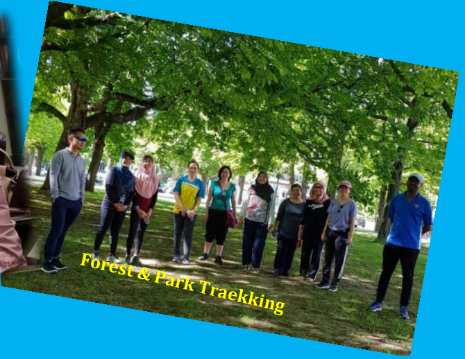
Forest & Park Traekking