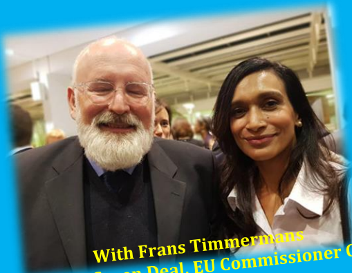
With Frans Timmermans European Green Deal, EU Commissioner Green Deal