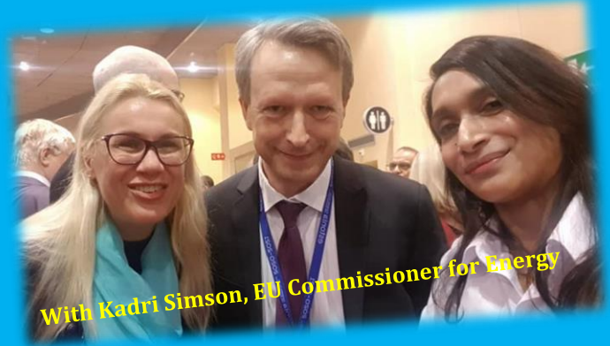
With Kadri Simson, EU Commissioner for Energy