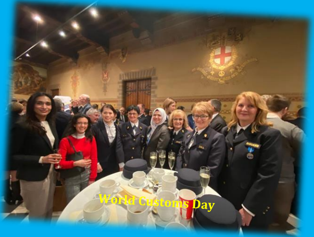
World Customs Day