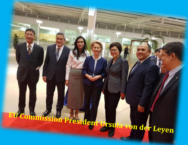
EU Commission President Ursula von der Leyen