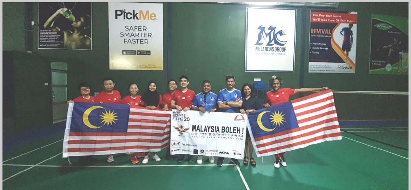
Malaysia's Architect Badminton Team in Sri Lanka