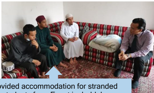
Provided accommodation for stranded students from Egypt in Jeddah