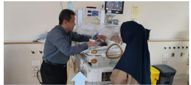
Taking fingerprint for birth registration of an umrah pilgrim's newborn stranded in Madinah

The determination and perseverance of the Saudi Government in combatting the pandemic is highly admirable. With its unique role as the Custodian of the Two Holy Mosques, it holds the responsibilities to ensure that the virus was not spread globally through those that came from all over the world for pilgrimage, Saudi Arabia had stringent measures in place. (...cont'd)