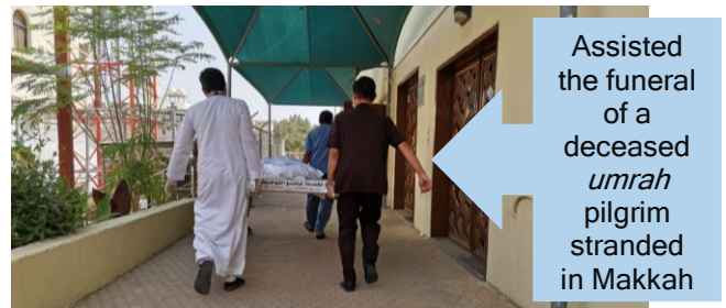
Assisted the funeral of a deceased umrah pilgrim stranded in Makkah