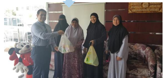
Donating food supplies for stranded umrah pilgrims