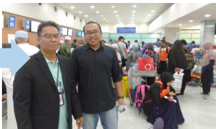
Consular visit to the airports