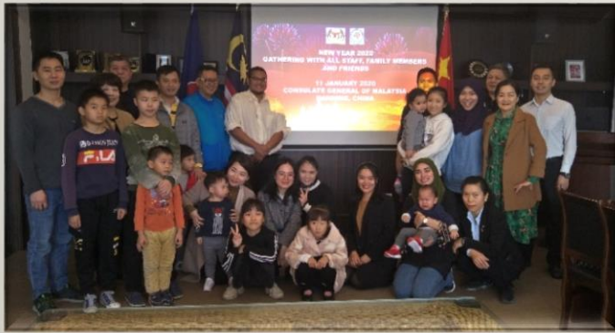
11 JAN 2020 - NEW YEAR 2020 GATHERING WITH ALL STAFF, FAMILY MEMBERS AND MALAYSIANS