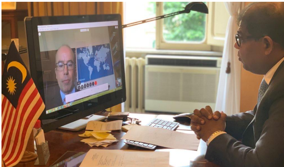
The Ambassador participated in the Malaysia-Turin Business Forum on 15 July to promote Malaysia-Turin economic relations.