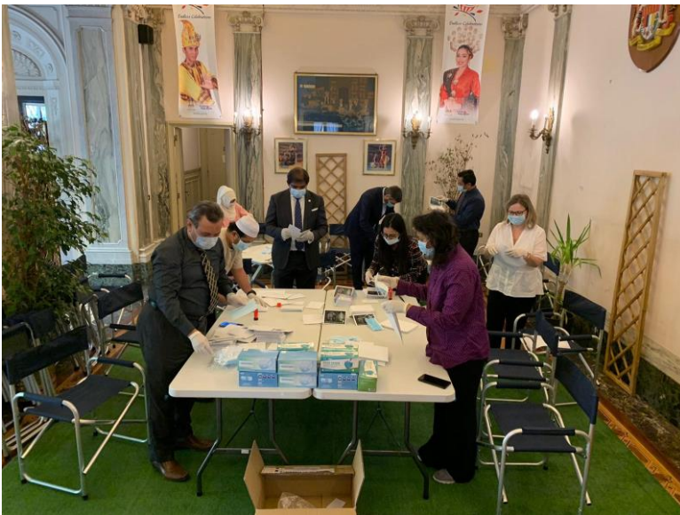
The Ambassador and officers packing mask to be distributed to all Malaysians residing in Italy.