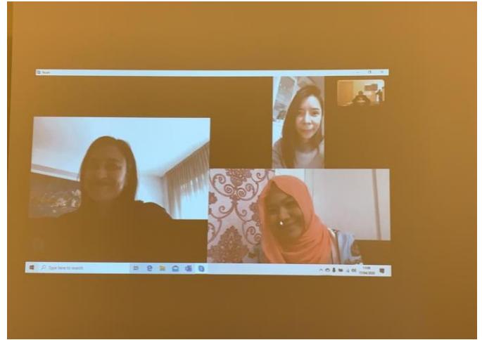
The Ambassador and officers engaging with Malaysian coordinators in various regions in Italy such as Liguria, Lombardia, Lazio, Piemonte, Veneto and Tuscany to get information on their situation. All Malaysians are safe and taking the necessary precautions.