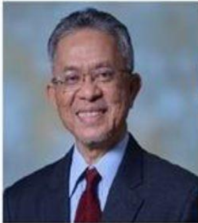
DATO' KAMARUDIN JAAFAR DEPUTY MINISTER OF FOREIGN AFFAIRS