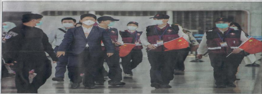
A team of medical experts sent by the Chinese government arrived in Malaysia on Saturday to help the country's fight against the COVID-19 pandemic.