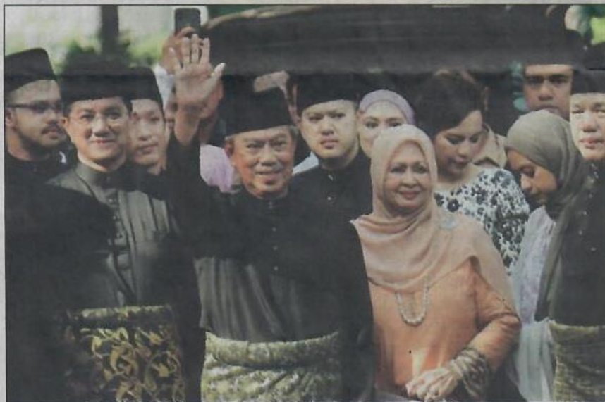
Muhyiddin Yassin (waving) leaves his house for his swearing-in ceremony in Kuala Lumpur on Sunday. Muhyiddin Yassin, a former deputy prime minister, took the oath of office to become Malaysia's new prime minister.

from major opposition parties, including the Barisan Nasional led by the United Malays National Organization, known as the UMNO, and became a leading candidate for prime minister.