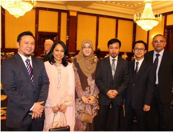
Members of the Embassy and Malaysian agencies with counterparts from Brunei Darussalam