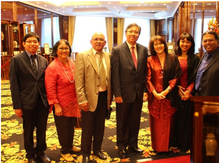
Above: Members of the Mari Bersama Club , Hamburg, posing with H.E. Ambassador and wife