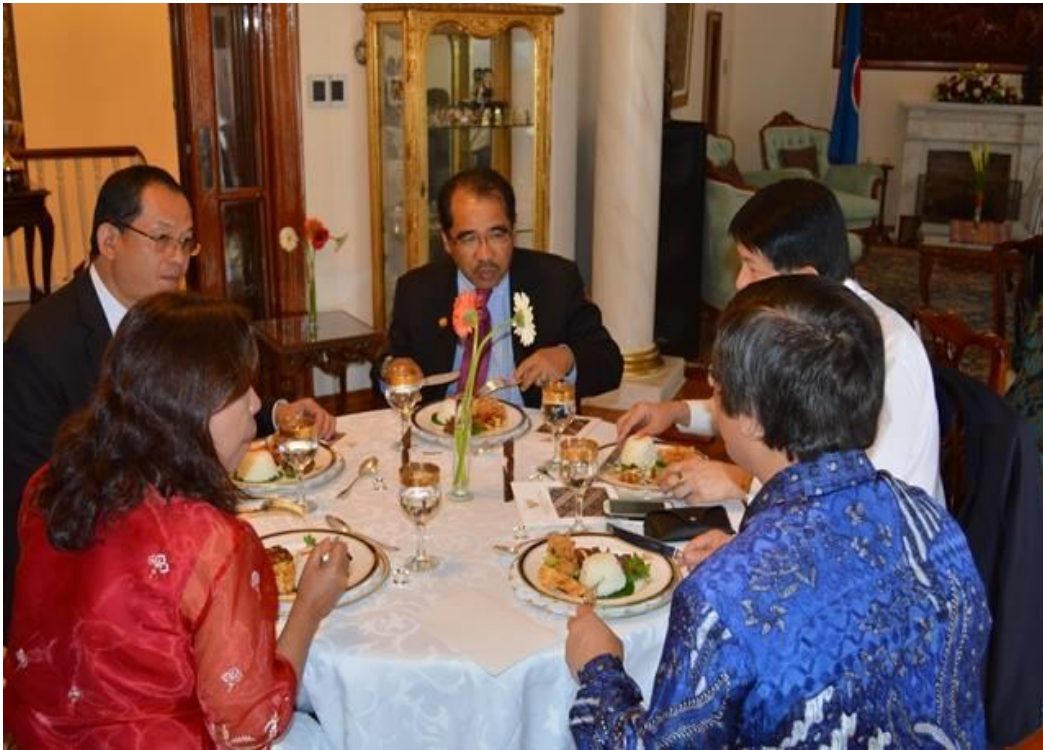
INTERVIEW WITH TIEMPO MAGAZINE, ARGENTINA, APRIL 2015