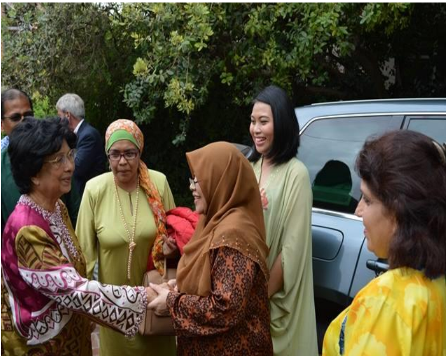
Pic 4 – Tun Dr. Siti Hasmah being greeted by Home Based Staff and spouses upon arrival