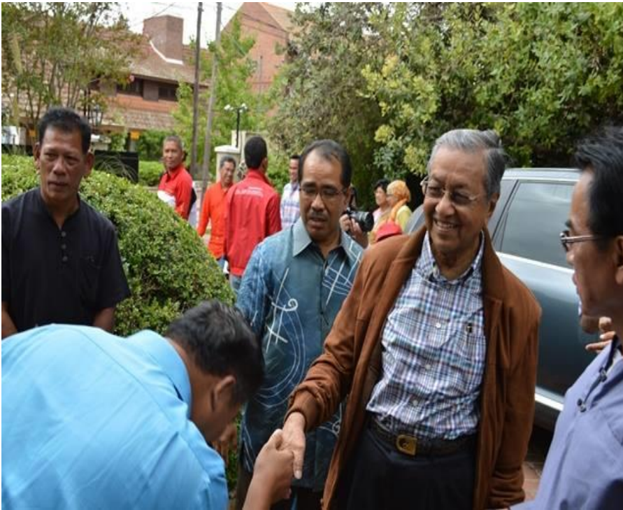
Pic 3 – The arrival of Tun Dr. Mahathir