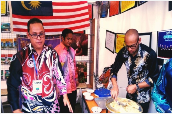
The Embassy staff preparing Roti Canai to be distributed to visitors.

The Embassy of Malaysia participated at the International Fair of Caracas which was co-organized by the Mayor of Caracas and the Ministry of Foreign Affairs, Venezuela. The 4-day event was held between 21 to 24 May 2015 at Diego Ibarra Square and participated by about 20 other diplomatic missions in Caracas.