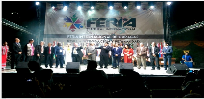
Opening Ceremony of the International Fair of Caracas.