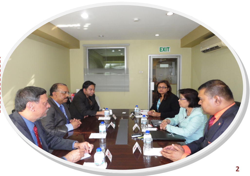
Courtesy Call by Tan Sri KSN on the Hon. Carolyn Seepersad-Bachan, Minister of Public Administration.