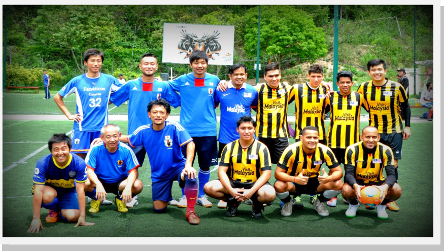
The Grand Final - Japan crowned Champions after a narrow 1-0 win over Malaysia in the final.