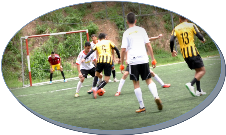
Tigre Malayo FC beaten a Venezuelan team during the semi-final match on penalties after a 2-2 draw.

The Embassy of Malaysia was one of the nine teams invited and participated in the Futsal Tournament organized by the Embassy of Japan in Caracas. During the tournament, the Embassy qualified into the final but lost 1-0 to the Japanese team. This was the first involvement of the Malaysian side in any futsal tournament in Caracas.