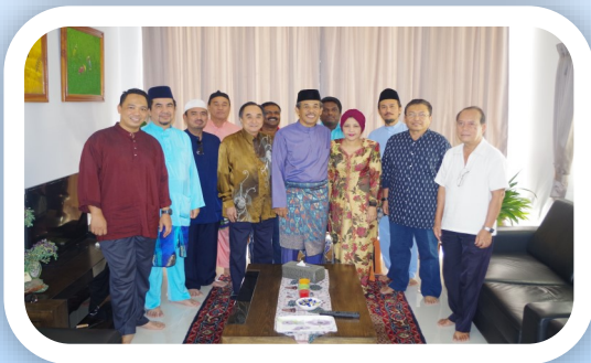
The MHS Group

Guests were served with the various Malaysian cuisines and traditional delicacies. The favourite home-made menu offered were beef and chicken rendang, ketupat, serunding, laksa Penang, laksa Johor, Nasi Tomato as well as traditional Malay desserts (buah melaka, roti jala, kueh bakar, agar-agar merah and popiah goreng) prepared by PERWAKILAN DILI. More than 50 guests joined in the Open House Aidilfitri's festivity.