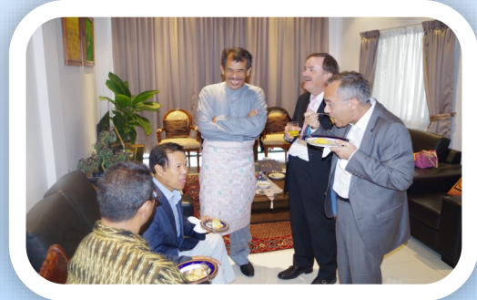
Ambassadors of Republic of Korea, European Union & Portugal