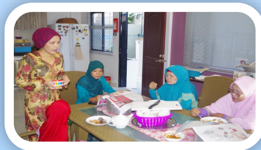
Visitors from the An-Nur Mosque