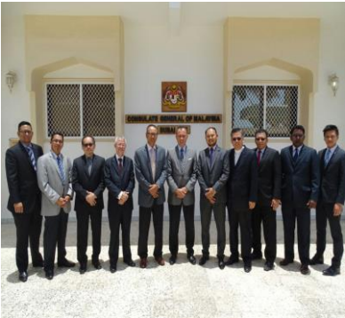
HBS Consulate General of Malaysia