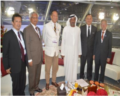
Tourism Malaysia meeting with HH Ahmed Bin Saeed Al Maktoum – CEO and Chairman of the Emirates Group