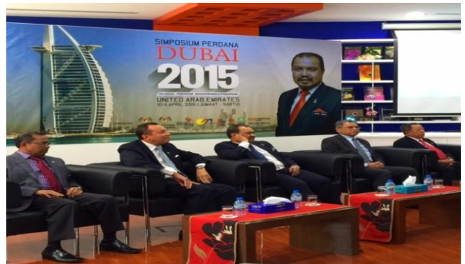
Working Visit to the UAE