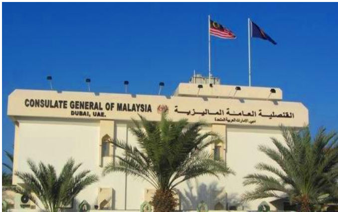
The Consulate General of Malaysia in Dubai, UAE