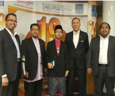
Tilawah Al Quran Dubai, UAE