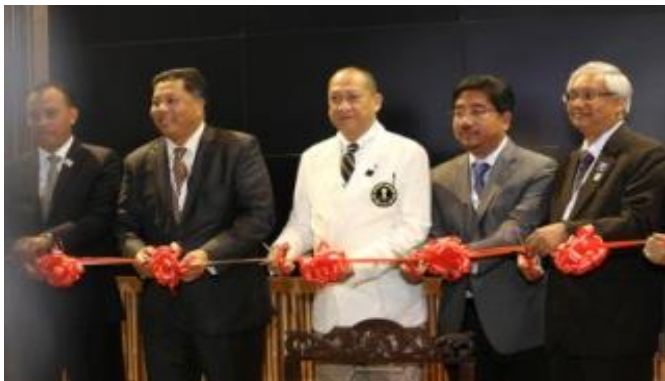
Working Visit to the UAE