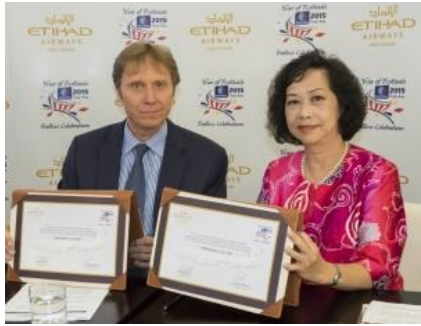
The signing for joint-marketing partnership between Tourism Malaysia and Etihad Airways at the Expo Milano 2015