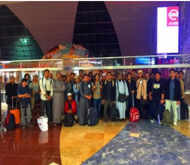
Evacuation of Malaysian students from Yemen