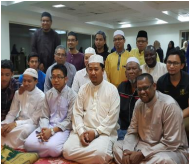
IFTAR and IHYA Ramadhan