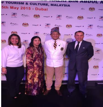
Arabian Travel Market