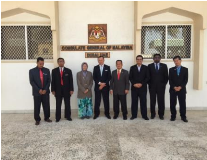
Perdana Symposium Delegates from JAKIM