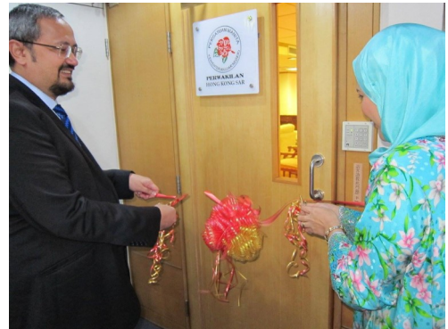
2015 AGM and Launching of PERWAKILAN Hong Kong SAR's Room on 5 February 2015