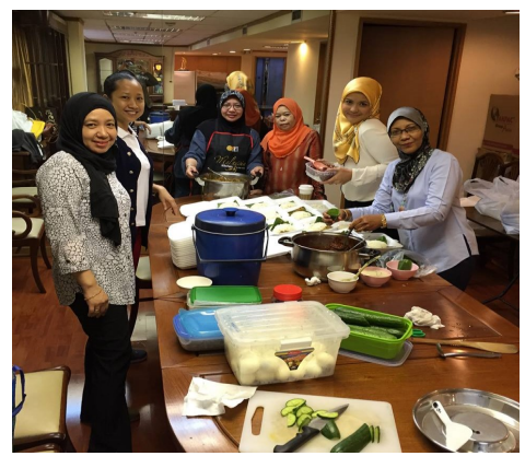
Jualan Nasi Lemak every Monday at PERWAKILAN's Room