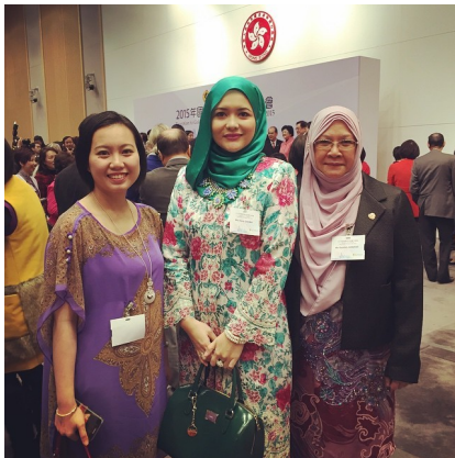
Woman's International Day Reception on 8 March 2015