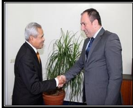
Ambassador with H.E Crnadak, Foreign Minister of Bosnia and Herzegovina

H.E. Ambassador Datuk Anuar Kasman had an introductory meeting with H.E. Mr. Igor Crnadak, Minister of Foreign Affairs of Bosnia and Herzegovina on 15 December.