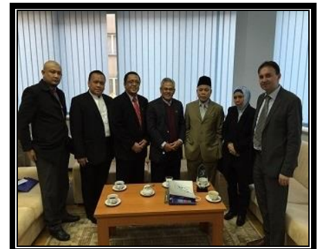
Ambassador with Zakat Delegation