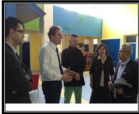
Ambassador being briefed by SOS Children's Village personnel