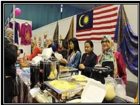
Perwakilan Members at the Malaysian Booth,

Embassy of Malaysia with the coordination of Ladies Association of Ministry of Foreign Affairs (PERWAKILAN), Sarajevo took part at the 2015 Diplomatic Winter Bazaar. The charity event was held on 5 December at Skenderija Hall, Sarajevo.