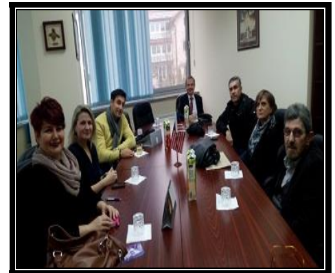
Committee member of MTCP Alumni Association, Bosnia and Herzegovina

The MTCP Alumni Association Committee had its year end meeting at the Embassy on 5 December to discuss programs for 2016. A number of activities for 2016 has been planned. These included sports and community-based activities within and outside Sarajevo.