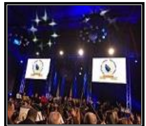
Orchestra performance for the National Day of Bosnia and Herzegovina