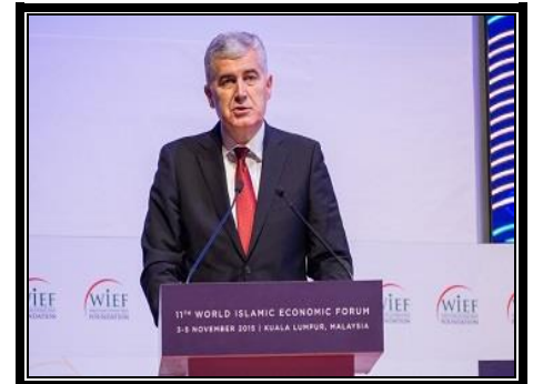
H.E. Dragan Covic, Chairman of Presidency of BiH at the 11th WIEF in Kuala Lumpur

H.E. Mr. Dragan Covic, Chairman of the Presidency of Bosnia and Herzegovina was on official visit to Malaysia from 2 to 5 November to attend the 11th World Islamic Economic Forum (WIEF) in Kuala Lumpur. The visit was at the invitation of the Honourable Dato' Sri Najib Razak, Prime Minister of Malaysia.