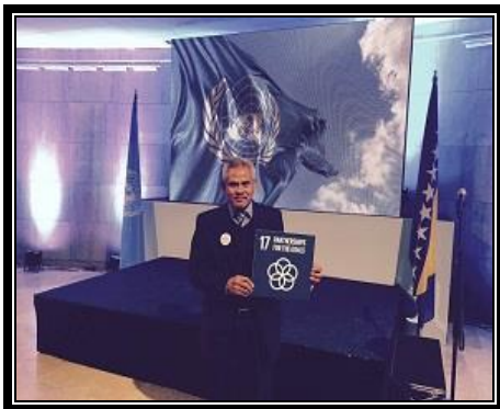
Ambassador at the Launching of Sustainable Development Goals