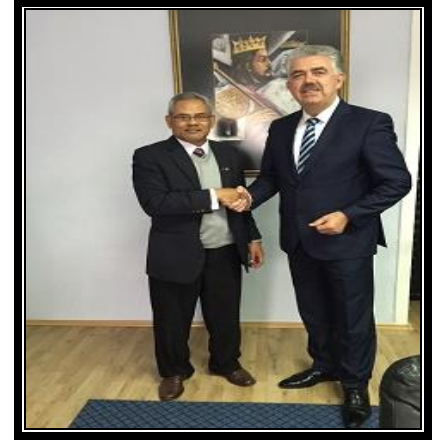
Ambassador with Prime Minister Nevenko Herceg

H.E. Ambassador Datuk Anuar Kasman paid a courtesy call on H.E. visit to Mr. Nevenko Herceg, Prime Minister of Herzegovina-Neretva Canton at his office in Mostar on 23 November. The two discussed ways and means to enhance bilateral cooperation between Malaysia and Herzegovina-Neretva Canton.