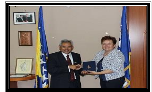
Ambassador with Minister Marina Pendes