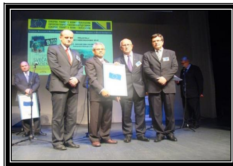
Ambassador received 'Friend of BiH 2015' Award