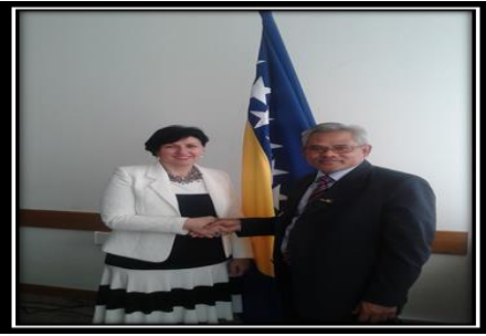
Ambassador with Minister Semiha Borovic

H.E. Ambassador Datuk Anuar Kasman paid a courtesy call on Her Excellency Mrs. Semiha Borovac, Minister of Displaced Persons and Refugees of BiH on 3 rd July at her Office in Sarajevo. They discussed key issues of mutual concern. Minister Borovac stated that BiH do not have problem of immigrants but rather displaced people and refugees. Minister Borovac thanked Malaysia for all the assistance that have been extended to help the resettlement of displaced people and refugees in BiH.