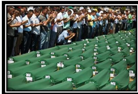
Potocari Memorial Cemetery