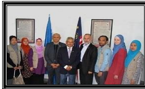
Representatives of Islamic Relief Malaysia with Ambassador