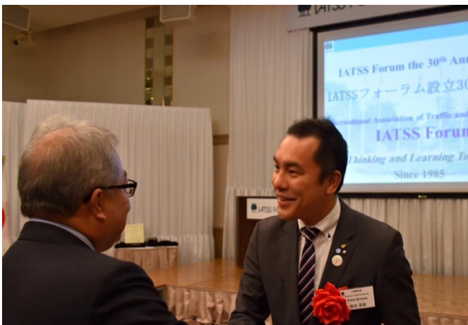
Meeting the Governor of Suzuoka during the 30th Anniversary of the IATSS Forum