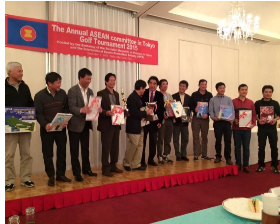
Prize giving ceremony at the annual ACT Golf Tournament 2015