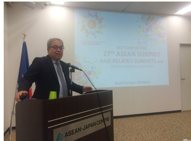
H.E Dato' Ahmad Izlan speaking at the ASEAN-Japan Centre on the outcome of the 27th ASEAN Summit and the IATSS 30th Anniversary Forum (below)