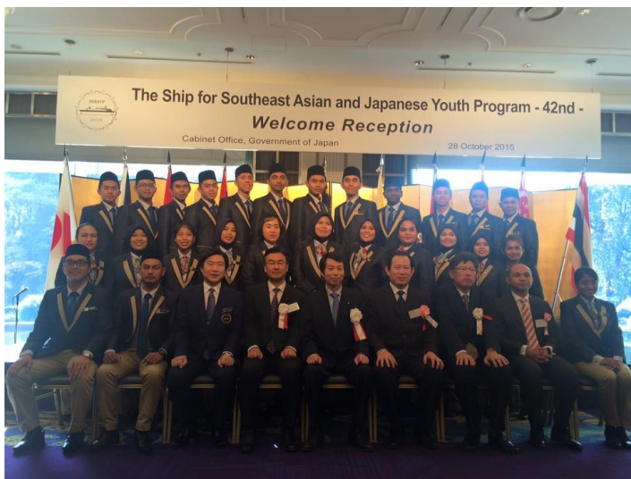
Malaysian participants at the welcome reception of the 42nd Ship of Southeast Asian Japanese Youth Programme 2015