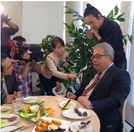
Media interview during the opening of the Halal Organic Restaurant in Tokyo