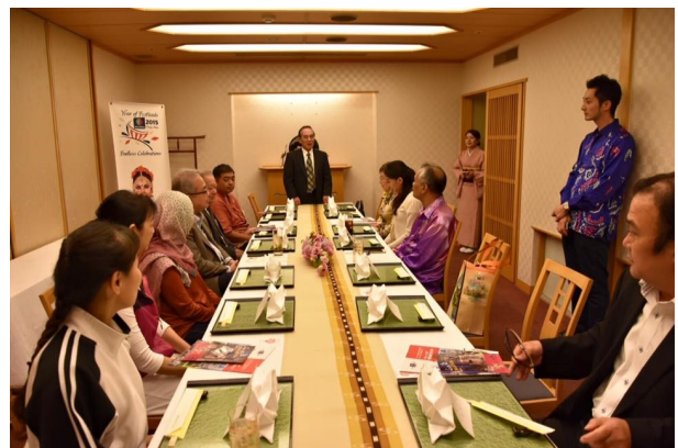
Dinner with Malaysia Okinawa Friendship Association