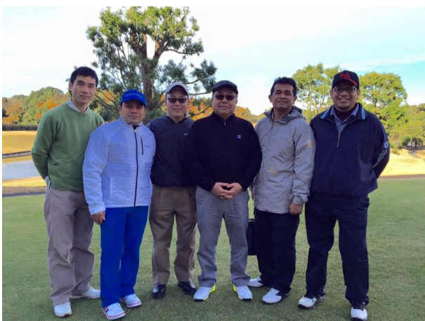
The Malaysian team at the annual ACT Golf Tournament 2015