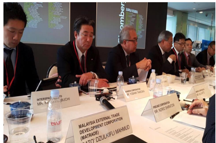
Accompanying the Minister of International Trade and Industry during the 2015 Trade and Investment Promotion Mission in Japan