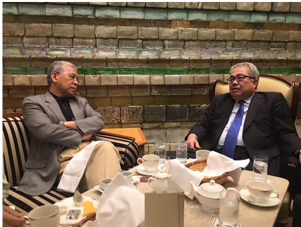
H.E Dato' Ahmad Izlan with YB Dato' Seri Idris Jusoh, Minister of Higher Education for Malaysian during the latter's official visit to Tokyo on 13 December 2015