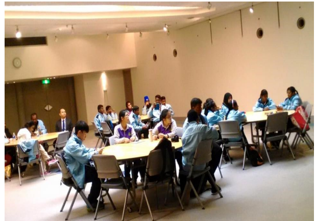
The Embassy's Counsellor with Students from SMK Sultan Sulaiman Shah, Selangor