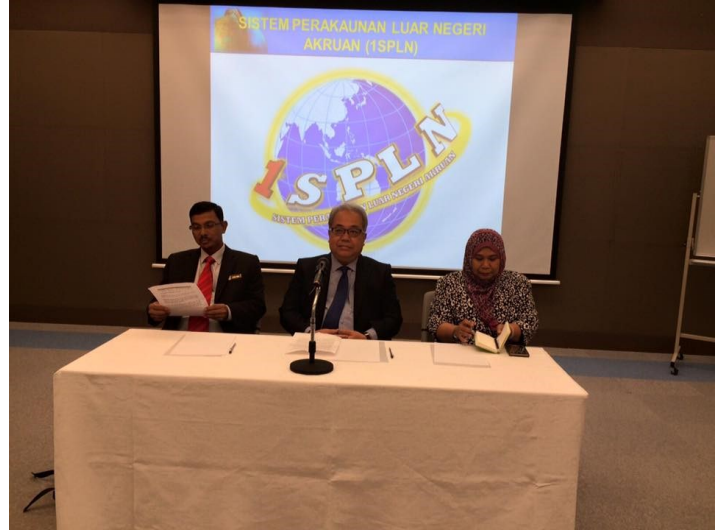
Playing host to the ISPLN regional course at the Embassy