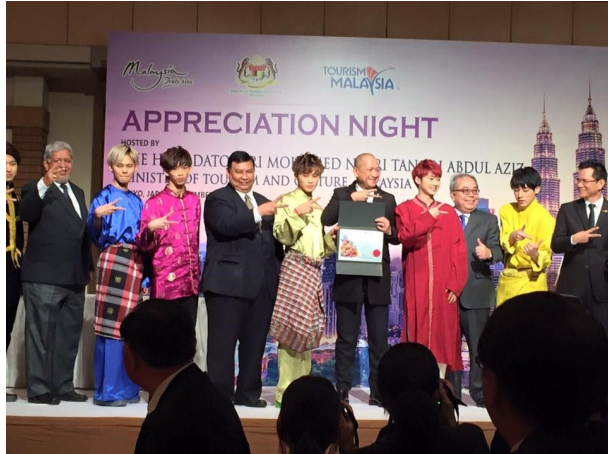
Tourism Malaysia's Appreciation Night hosted by the Honorable Minister of Tourism and Culture, YB Dato' Seri Mohamed Nazri bin Abdul Aziz, in honor of TM's Japanese partners.

Dato' Ahmad Izlan also receives various courtesy calls and guests at his office during the period. The Ambassador also participated in the 2015 Japan Halal Expo as well as the 2015 Tourism Malaysia Osaka's familiarization tour to Okinawa.