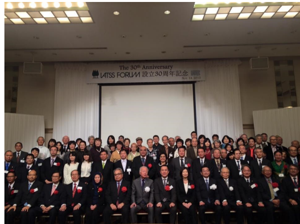
The VIPs and participants of the IATSS Forum in Suzuoka