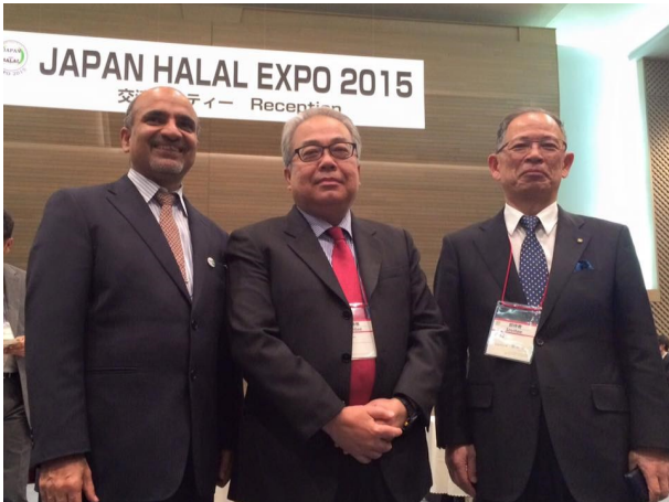
Posing with the Malaysian delegation at the 2015 Japan Halal Expo