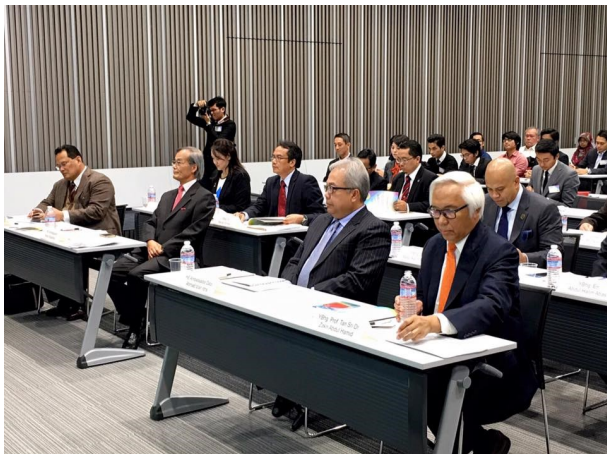
Officiating the Malaysian Symposium in Meiji University organized by Team LEP and the student association of Japan