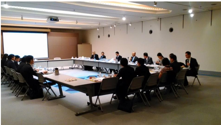
Malaysia chaired the meeting between the Tokyo Metropolitan Government (TMG) and ACT officials in charge of disaster to further improve ACT Emergency Guidelines

The Embassy officials participated in various programmes in the fourth quarter of 2015. Some of the important events included the hosting of meeting between the Tokyo Metropolitan Government (TMG) and ASEAN officials in charge of disaster to discuss issues relating to disaster management and disaster preparedness. The Embassy was also represented at the 50th Anniversary celebration of Josai University, engagement with the Ministry of Land and Infrastructure (MLIT)/Japanese Rail officers on high speed train as well as the reception to welcome Malaysian participants for youth programmes such as the Ship for Southeast Asia Youth Programme (SSEAYP 2015), Japan-ASEAN Youth Leaders Summit and the 30th Anniversary of the IATSS Forum.