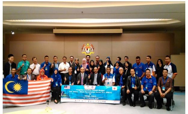
The Embassy's Counsellor and Assistant Defense Attaché with delegation from Kor SISPA

The Embassy received twenty-four students and teachers from SMK Sultan Sulaiman Shah, Selangor on 10 December 2015. The visit was part of the school's International Student Exchange Program 2015.