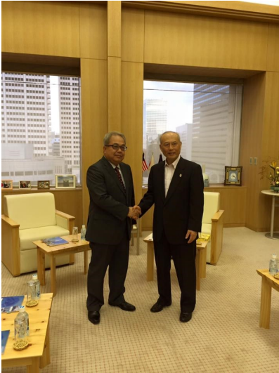
Courtesy call on the Governor of Tokyo