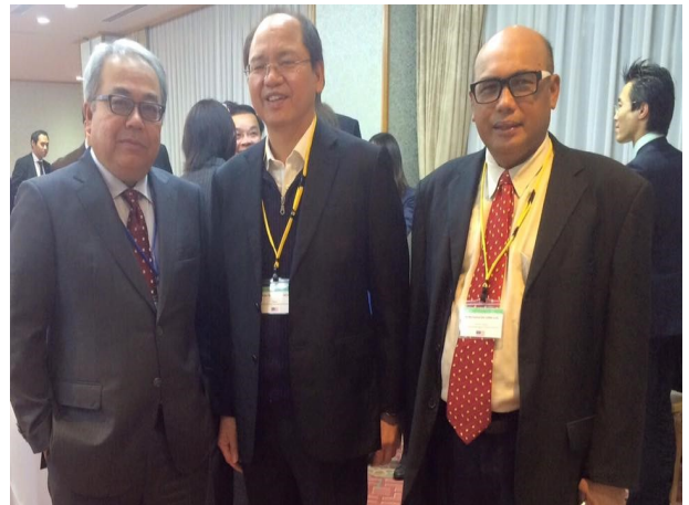
HE Dato' Ahmad Izlan and the Honorable Datuk Seri Panglima Madius Tangau, Minister of Science, Technology and Innovation at the Welcoming Reception of the FNCA 16th Ministerial Level Meeting in Tokyo