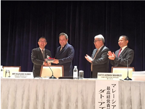
2015 Malaysian Trade and Investment Promotion Mission in Tokyo and Osaka led by the Minister of International Trade, Dato' Seri Mustapha Mohamad . The Minister was accompanied by senior officials of MITI Malaysia, the Malaysian Investment Development Authority (MIDA), the Malaysian External Trade Development Corporation (MATRADE), various State Government Investment Agencies and a group of leading Malaysian businessmen .