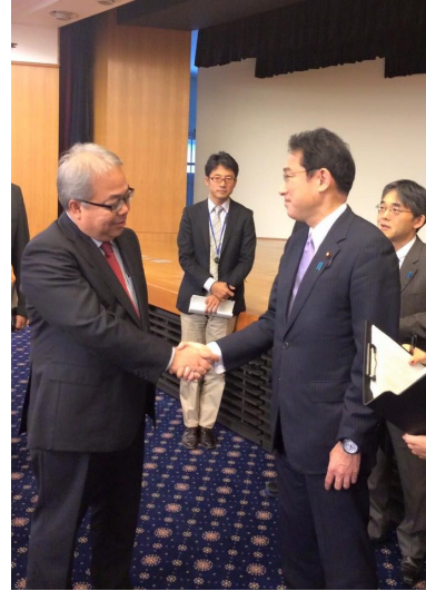
HE Dato' Ahmad Izlan with Foreign Minister Fumio Kishida at the briefing by the latter at the Ministry of Foreign Affairs