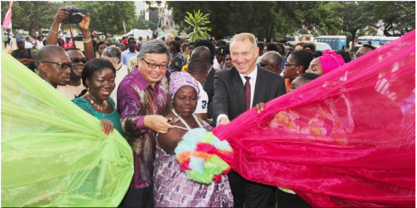
H.E Cheong Loon Lai, High Commissioner of Malaysia cutting the ribbon to mark the opening of the colorful Ghana Garden and Floral Show 2016.

On 9 September recently, H.E Cheong Loon Lai, High Commissioner of Malaysia to Ghana officiated the opening of the 4th Ghana Garden and Floral Show 2016. The event was organized by Stratcomm Africa in collaboration with the Ministry of Tourism, Culture and Creative Arts of Ghana. Other dignitaries to the event were the Hon. Elizabeth Ofori-Adjare, Minister of Tourism, Culture and Creative Arts; Hon. Nii Osah Mills, Minister of Land and Natural Resources and diplomatic corps.