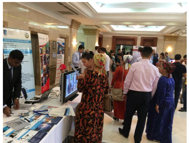
Crowd at the Exhibition