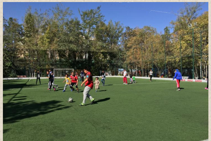
Mixed futsal match