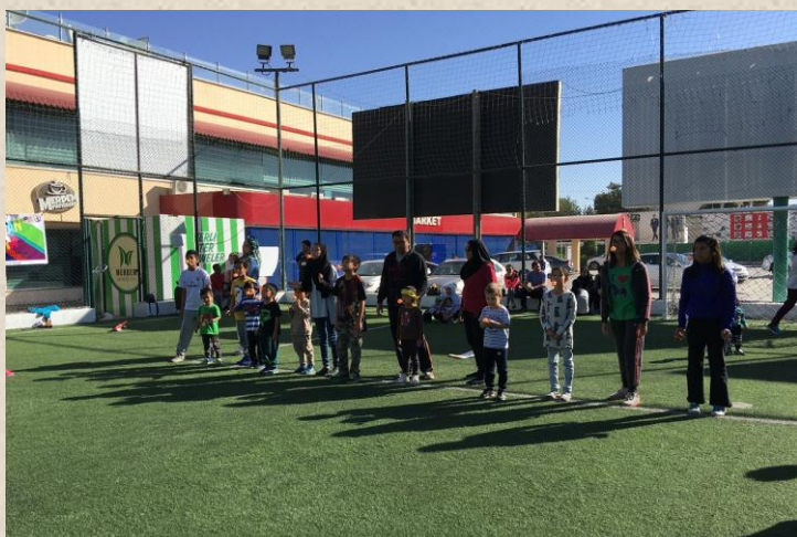
Ping-pong-ball-and-spoon relay for children