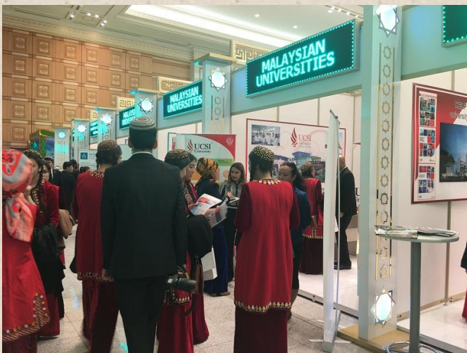
Crowd of potential Turkmen students at the Exhibition

Malaysia's participation in the exhibition was very successful as it has attracted more applications and managed to bring in more students to study in Malaysia. There are currently about 300 Turkmenistan students in Malaysian higher education institutions and the number keeps increasing. There is a very high potential to bring more Turkmenistan students to Malaysia as the qualifications from Malaysian institutions are highly regarded in Turkmenistan.