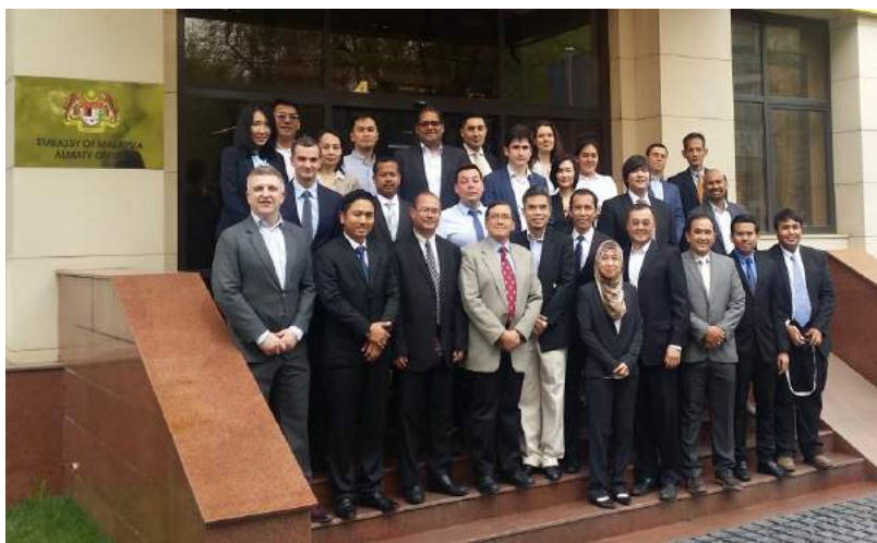
Participants of Kazakhstan-Malaysia Oil & Gas Business Forum held at the Embassy of Malaysia in Almaty on 4-5 April 2015.

Kazakhstan produced 1.7 million barrels per day