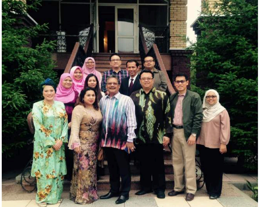
The delegation from Attorney General Chamber Malaysia, led by Tan Sri Mohamed Apandi Ali together with officials from the Embassy of Malaysia at Rumah Malaysia.

Negotiations of the treaties on extradition and mutual legal assistance in criminal matters proceeded smoothly during the visit.