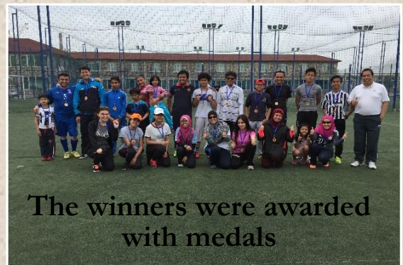
The winners were awarded with medals

The diplomats and their families as well as other guests from ASEAN member countries (Indonesia, Singapore) participated in a range of sport and folk games. Among the activities included were Volleyball, football and games for children. Guests then were invited to savour dishes.