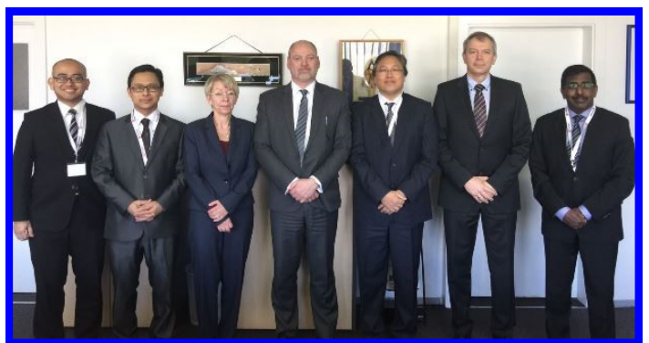
Left: Delegation after conducting a site tour at Atotech Above: Group photo with management of PacTech