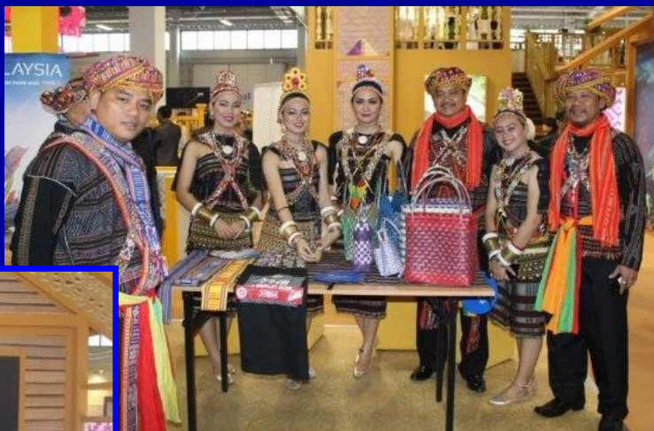
Above: Exhibitors from the Rungus ethnic group