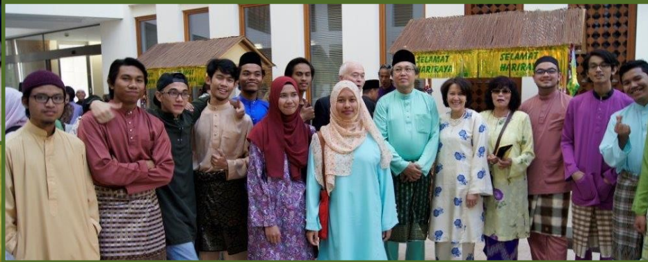
(See page 9 for photos of Hari Raya at Rumah Malaysia)