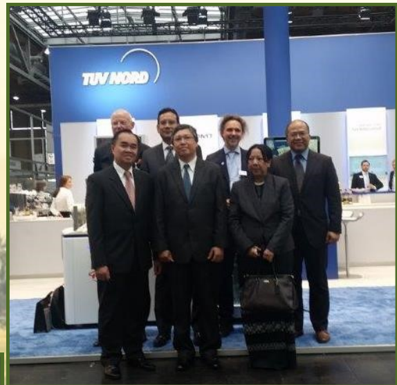
Above: ASEAN Ambassadors posing in front of the pavilion of TÜV Nord.