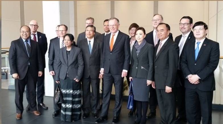
ASEAN Ambassadors with Mr. Stephan Weil, Minister President of Lower Saxony (7th from right)

In 1947, Hannover Export Fair was introduced as a way to stimulate economic activity in the State of Lower Saxony, then struggling to recover from the aftermaths of the World War. Fast forward a couple of decades later, the Fair, now called Hannover Fair, is a world-leading expo on application of technology in industries. It now attracts on average more than 200,000 visitors and more than 5,000 exhibitors from some 70 countries worldwide.