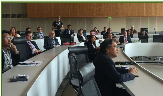
Participants of the Seminar "Starting Business in Malaysia: What Can One Expect?"