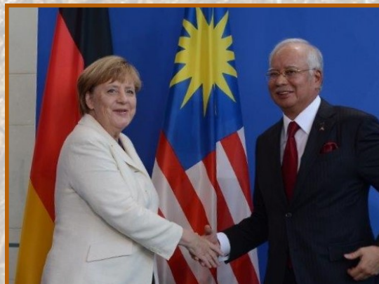
Above Right: Prime Minister Najib and Chancellor Merkel after the joint press conference.