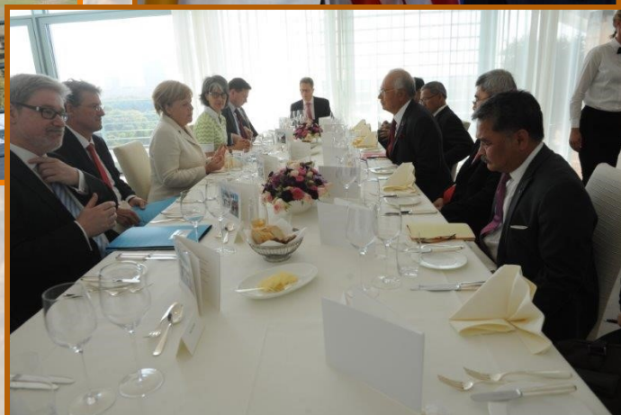
Right: Delegation from both sides discussing issues of mutual concern during the working lunch.

Berlin, 27 September - As the highlight of the official visit of Prime Minister Dato' Sri Mohd Najib Tun Haji Abdul Razak to Germany, German Federal Chancellor Dr. Angela Merkel hosted Prime Minister Najib and delegation in a working lunch at the Federal Chancellery. The working lunch was preceded by a simple, yet majestic official welcoming ceremony at the courtyard of the Federal Chancellery. After inspecting the Guard of Honour, both leaders proceeded to the working lunch, where they discussed issues of mutual importance. Apart from the state of bilateral affairs between Malaysia and Germany, the issue of terrorism and extremism were high in the agenda of the meeting. Both countries shared their experiences in dealing with the spread of extremist ideologies and in the case of Malaysia, Prime Minister Najib highlighted Malaysia's efforts to promote the voice of moderation, particularly through the global movement of the moderates.