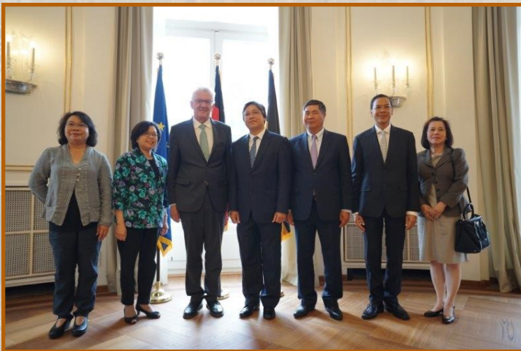
Left: Members of the BAC posing for a photo with Minister-President Winfried Kretschmann.

To conclude the working visit, the delegation had a breakfast meeting with Dr. Nicole Hoffmeister-Kraut, Minister of Economic Affairs, Labour and Housing of Baden-Württemberg on 14 July 2016. Representatives of a number of local agencies in Baden-Württemberg's were present at the meeting to deliver presentations on themes revolving around the potentials of Baden-Württemberg as a business location.