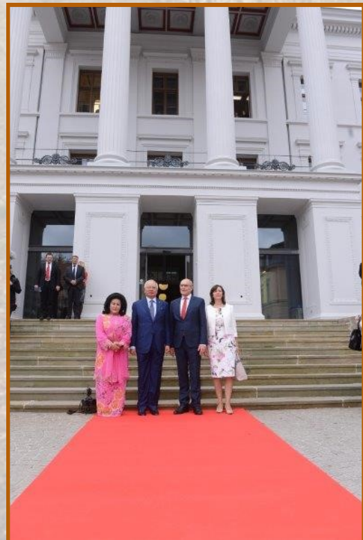
Right: Prime Minister Najib and wife Datin Sri Rosmah Mansor with the first couple of Mecklenburg-Vorpommern in front of the State Chancellery.