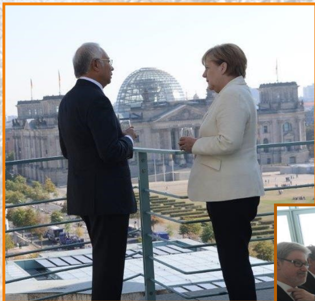
Above: Prime Minister Dato' Sri Najib Razak having a discussion with Chancellor Merkel prior to their working lunch.