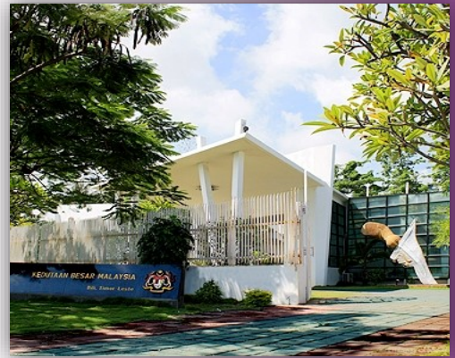
EMBASSY OF MALAYSIA, AVANIDA DE PORTUGAL DILI, TIMOR-LESTE