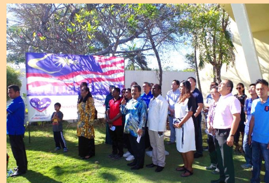
Ambassador together with the Malaysian Community paying their respect during the National Flag hoisting Ceremony.

Malaysia and the Democratic Republic of Timor-Leste enjoys a cordial and friendly bilateral relationship. Both the countries have a good working relationship with all circles of people.