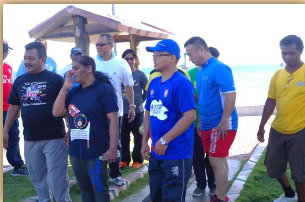
Arrived at the finishing point at the Light House of Farol, Dili