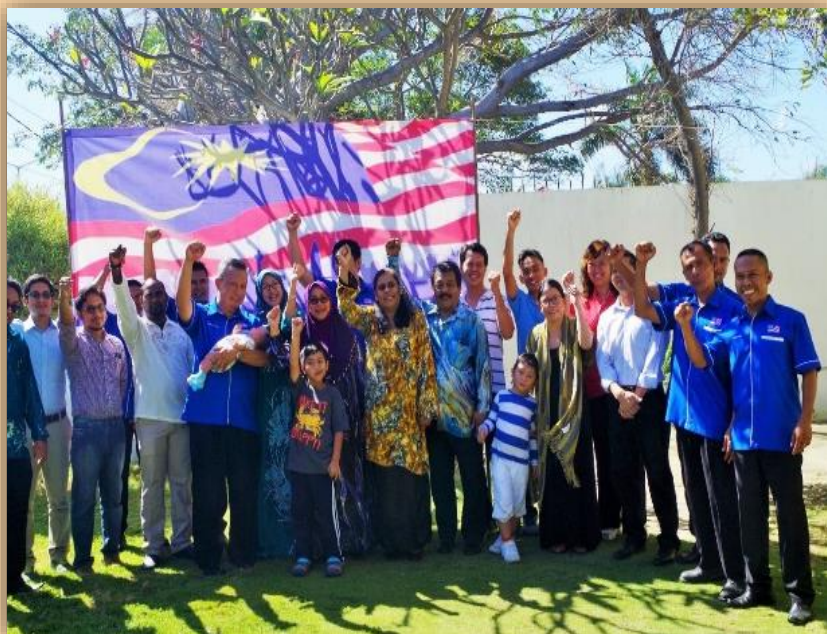
Group Photo of Ambassador with the Embassy Home Based and Local Staff and Malaysian community after the flag raising ceremony