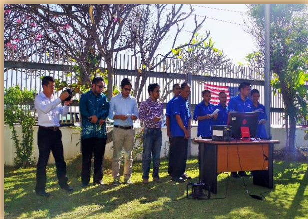
Choir Group Leading the Three Songs sung during the Flag Raising Ceremony