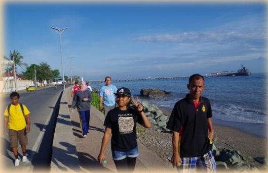
Figure 1. Along the beach road of Avenida de Portugal

More photos during Brisk Walk Activity in Conjunction with 2016 National Sports Day Event Organized by the Malaysian Embassy in Dili, Timor-Leste together with Malaysian Community in Timor-Leste