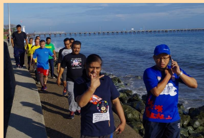
On the way along the beach road of Avenida de Portugal through to the finishing point at the Light House of Farol of Dili.