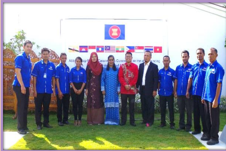
Group Photograph of HBS and LRS of the Embassy of Malaysia in Dili, Timor-Leste