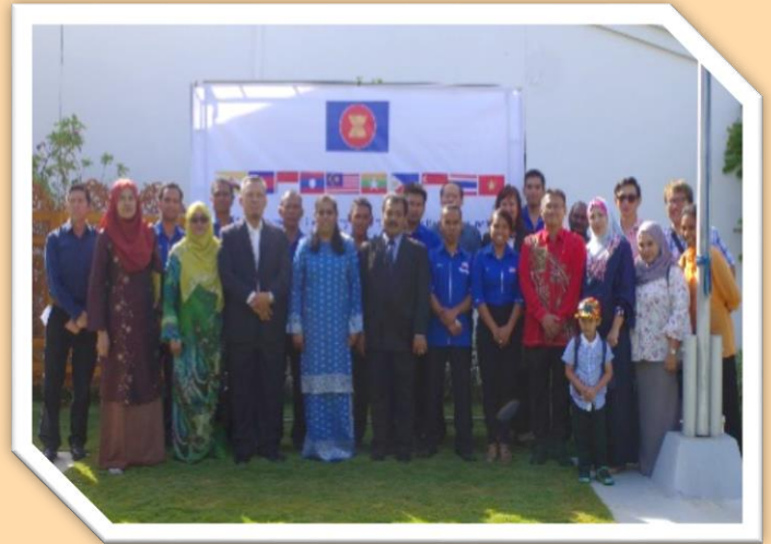
Group Photograph of Malaysia Officials and the Malaysians in Dili, Timor-Leste.

The Radio and Television of Timor-Leste (RTTL) also attended the celebration and interviewed the ASEAN Ambassadors on the support for Timor-Leste to become an ASEAN member.