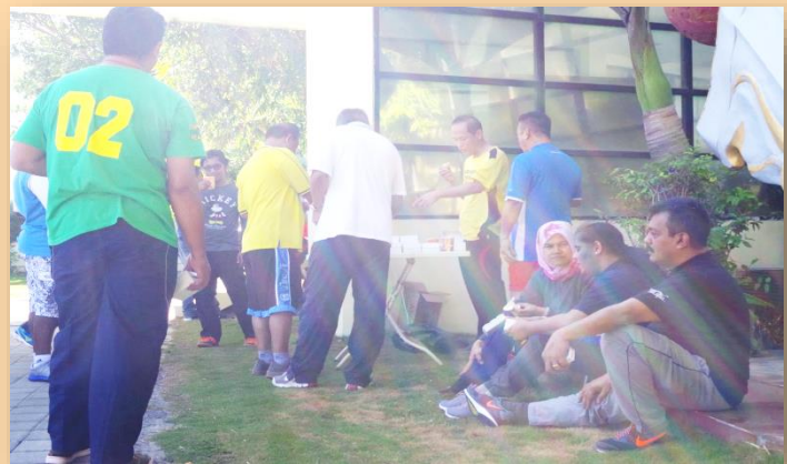
Back to the Embassy after 5km walk and enjoying drinks and light food