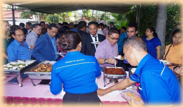
Guest at the Malaysia's Embassy booth having Nasi Lemak .