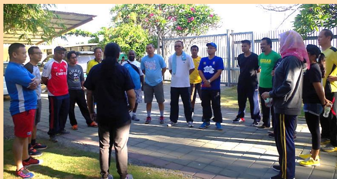
Briefing and warming up before starting the brisk walk event.

Brisk Walk ini diadakan dengan santai dan sambil menikmati udara tepi pantai sepanjang jalan Pantai Kelapa yang berakhir dalam tempoh masa 1 jam 30 minit. Para Peserta juga telah dihidangkan dengan minuman dan kuih-muih ringkas sebelum acara bersurai.