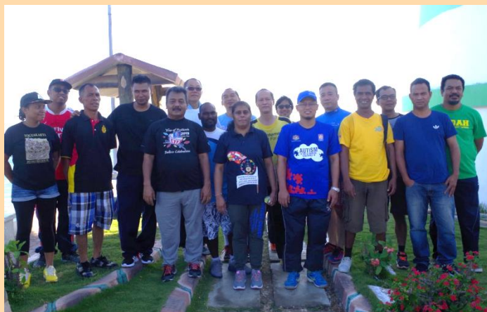
Photo session after 2.5 km at the finishing point (Light House) at Farol of Dili