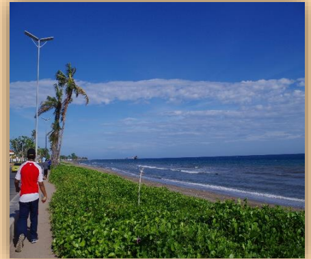
On the way back to the Embassy of Malaysia