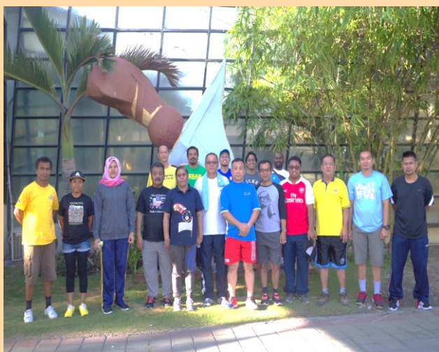
Photo session with H.E. Ambassador before the start of the brisk walk