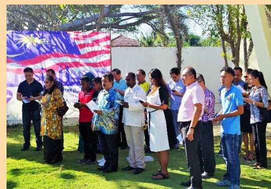
Malaysian Communities in Timor-Leste singing the National Anthem during flag raising ceremony