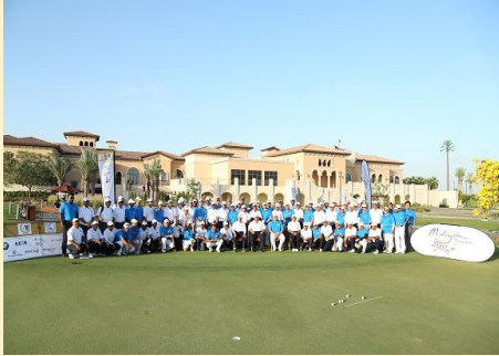
Friendly Golf Tournament between Team SAS and TMF in Dubai 2016