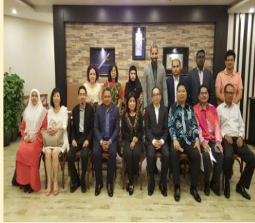
Networking Session from NCCIM delegation 2016