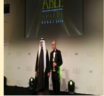
Tun Abdullah received ABL Statesman Award 2016