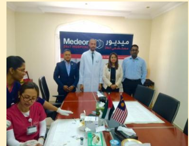
Health Clinic by Medeor Hospital at the Consulate