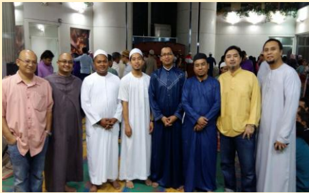
Malaysian community attended special prayers function at MATRADE Hall on 2016