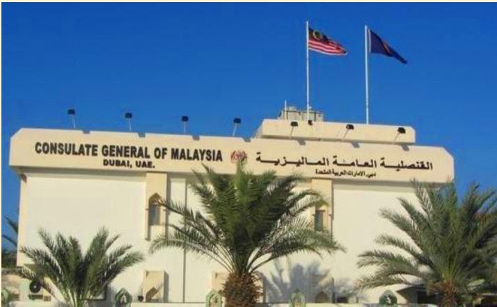
The Consulate General of Malaysia in Dubai, UAE

Website : http://www.kln.gov.my/web/are_dubai/home Email : mwdubai@kln.gov.my Phone : + 971-4-3985843 / +971-4-3985847 Fax : +971-4-3985809