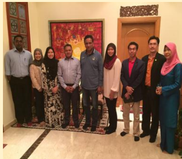
Transit YB Deputy Minister of Foreign Affairs 2016