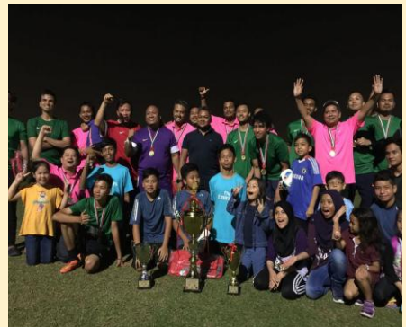
DUBAI ASEAN CUP 2016