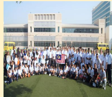
National Sports Day 2016