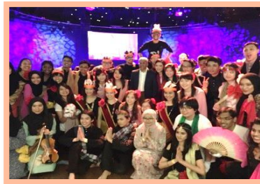
With Malaysian students at RCSI Cultural Nite.