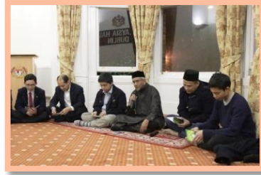
Tahlil for Malaysian who passed away in Dublin.