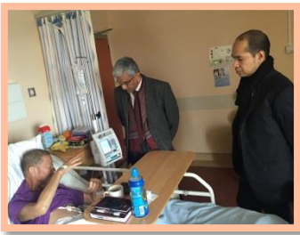
Visiting a Malaysian in Hospital, Galway.