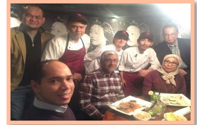
Dinner at LemonGrass Restaurant.