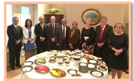
Dinner with Presidents and CEOs of Irish tertiary institutions.