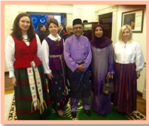
New Year Greetings with Diplomatic Corp.