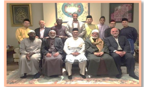
Dinner with Imams and Muslim community leaders in Ireland.