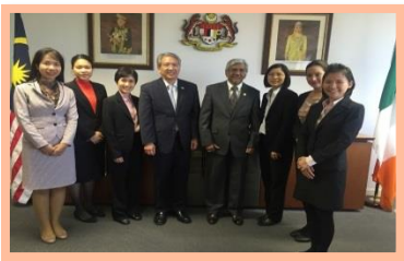
Call by Ambassador of Thailand and delegation from Thai MFA.