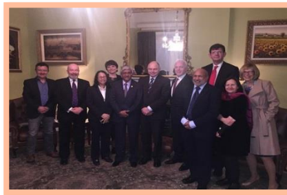
Dinner hosted by President, University College Dublin (UCD).