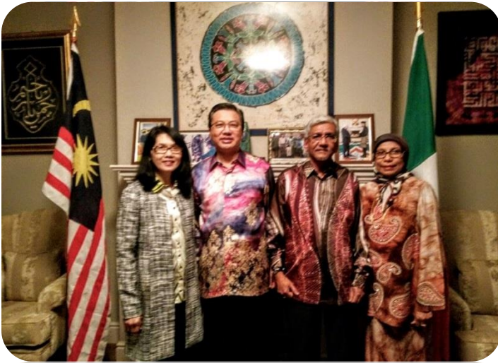
5 October: Hosting Dinner in honour of YB Minister of Transport