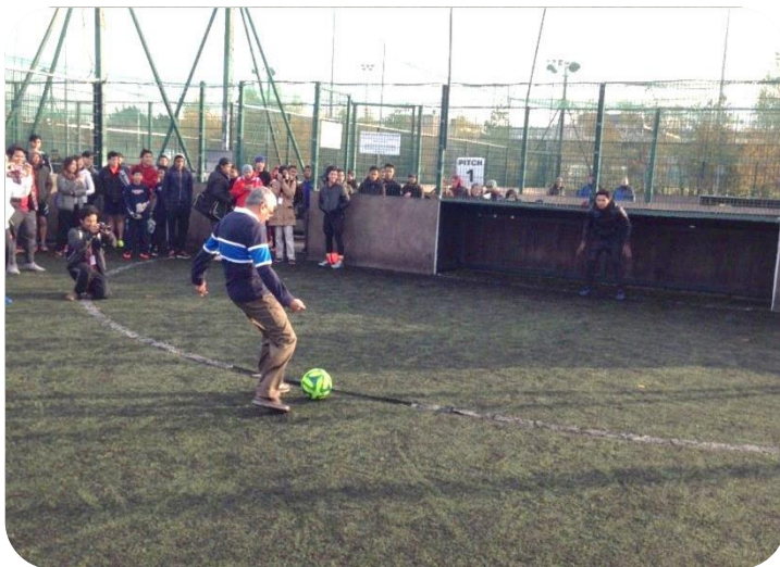
20 November: Malaysia- Ireland Games 2016