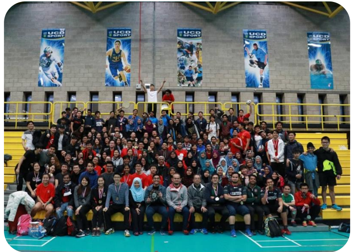
22 October: Penang Medical College Student Association Sports Day