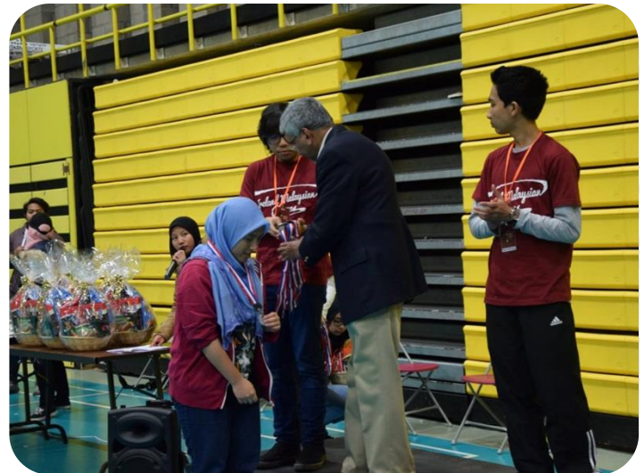
20 November: Malaysia- Ireland Games 2016