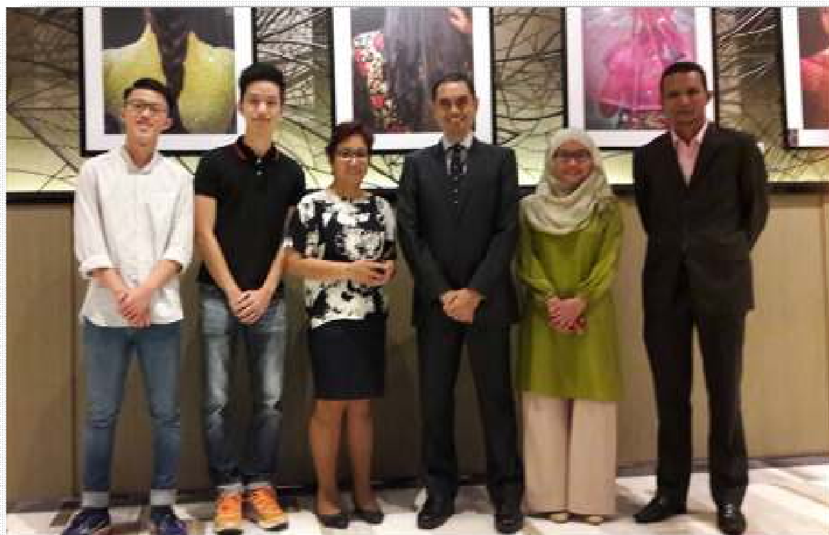
H . E Ambassador with fellow Malaysian living in Nha Trang City