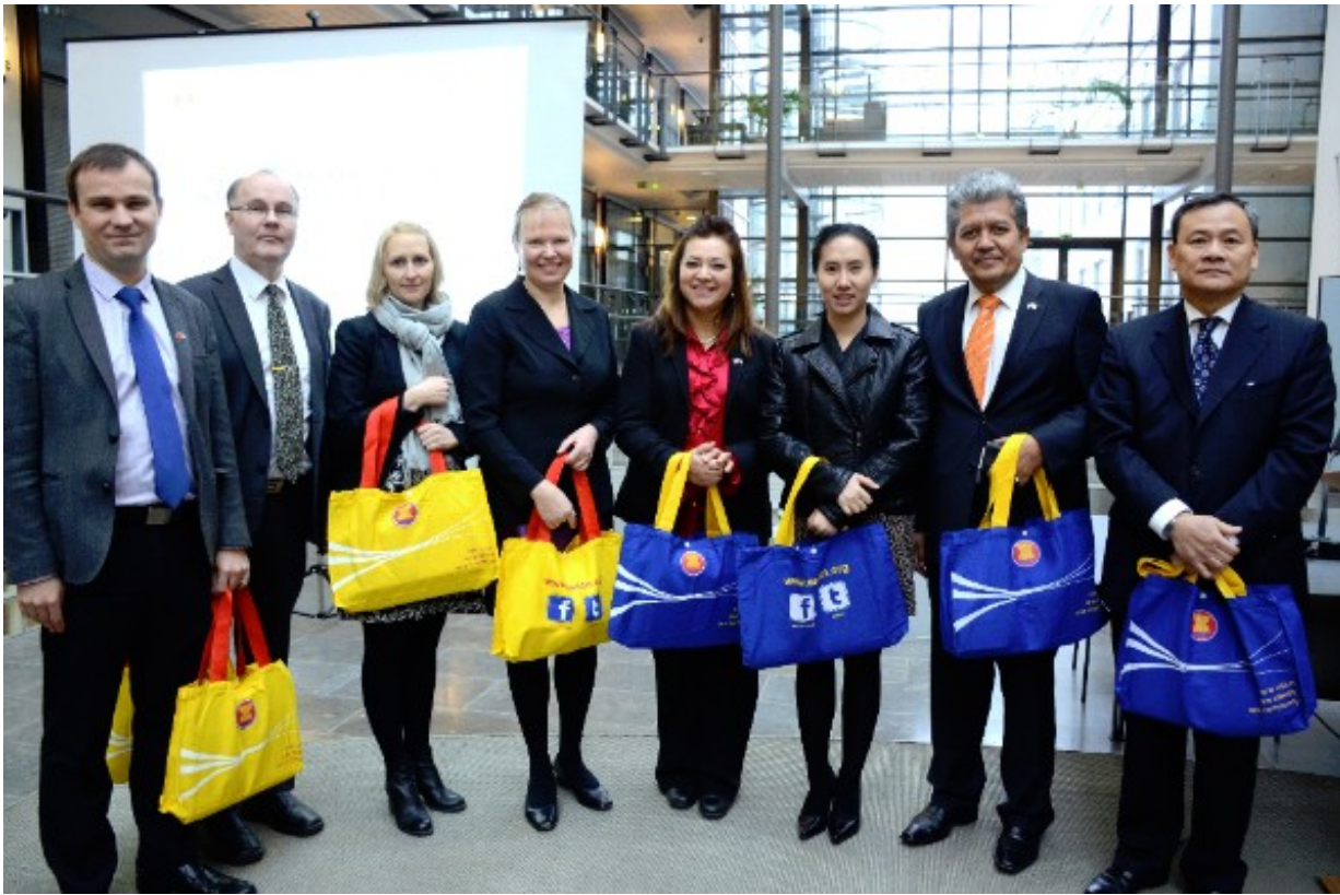
Speakers of the ASEAN outreach seminar