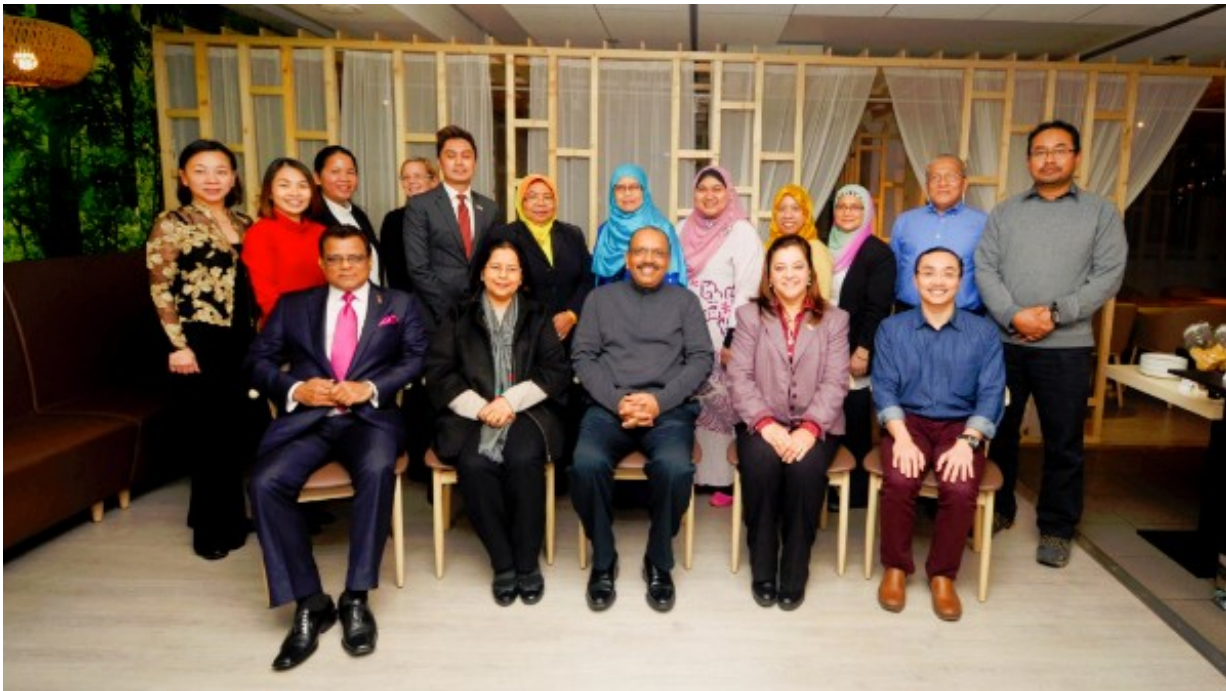
Townhall Meeting at restaurant Borneo with the Chief Secretary of the Government of Malaysia