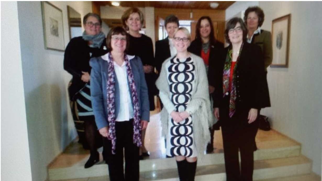
The Women Ambassador's Group with the Speaker of Parliament Maria Lohela.

guests such as Ms. Anne-Mari Virolainen, Chair of the Grand Committee, H.E. Ms. Anne Berner, Minister of Transport and Communication/Minister for Nordic Cooperation, and Speaker of the Parliament Ms. Maria Lohela.