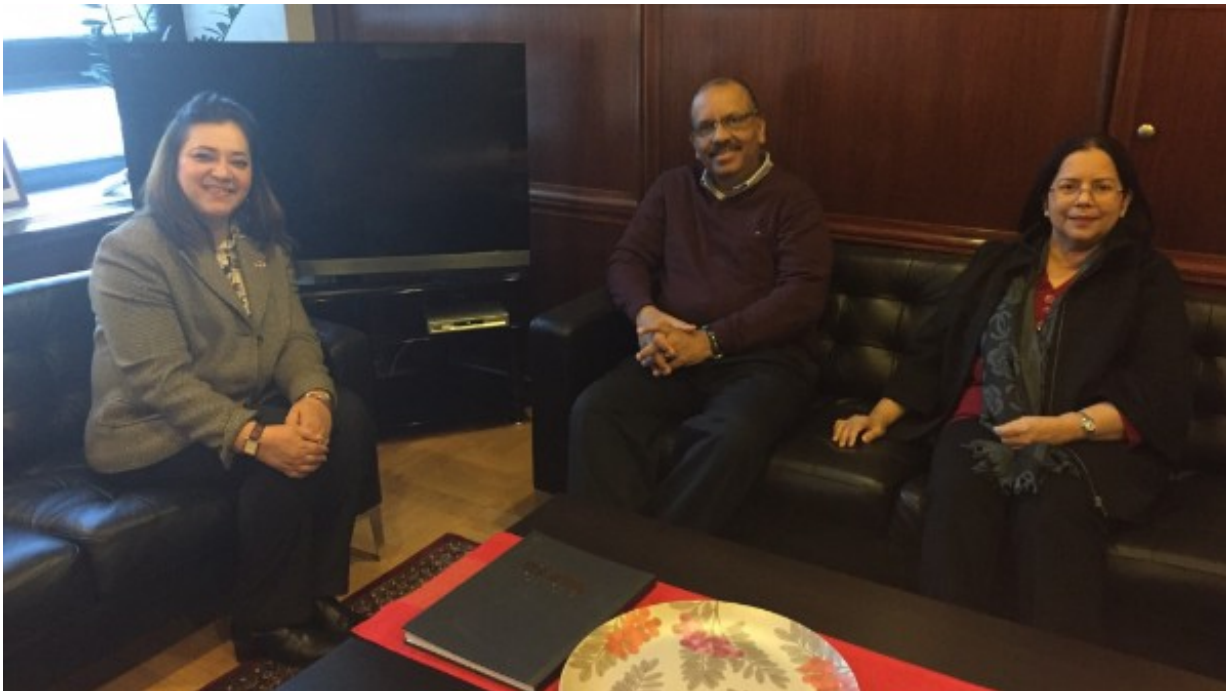
Visit by the Chief Secretary of the Government of Malaysia to the Embassy chancery