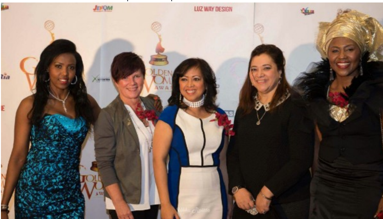
Wodess Golden Women Awards