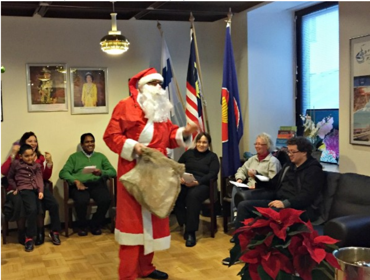
Santa Clause at the Little Christmas party