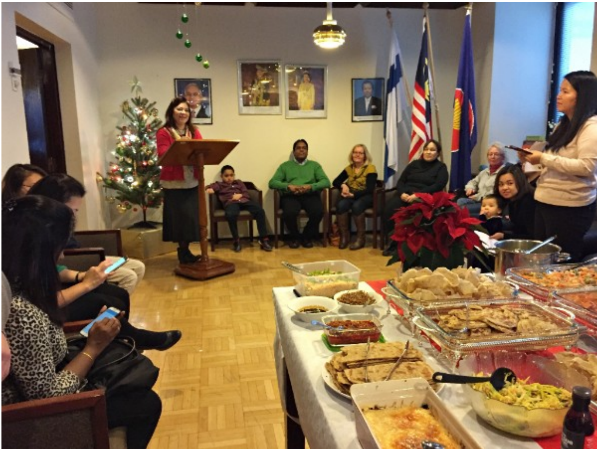
Ambassador's speech at the Little Christmas party