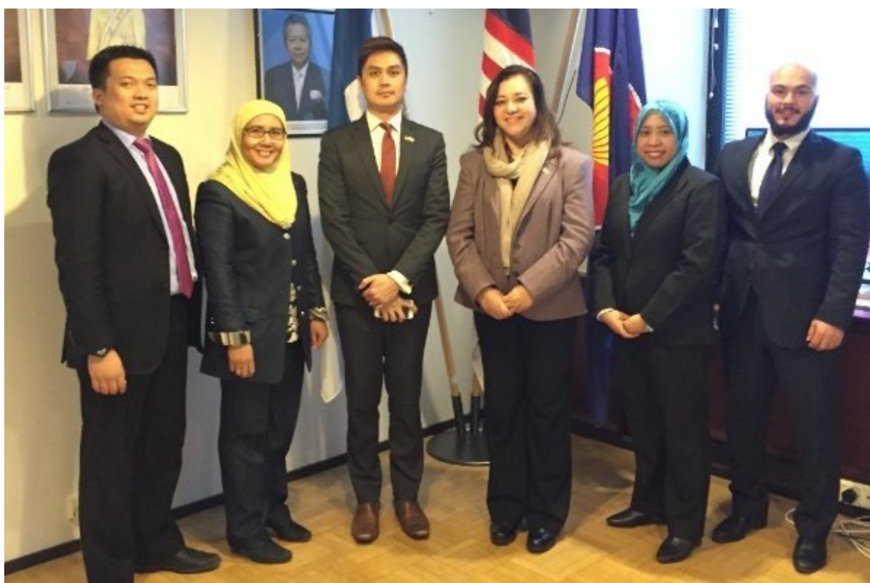
Representatives of MIDA Stockholm, Embassy of Malaysia and MATRADE at the business seminar