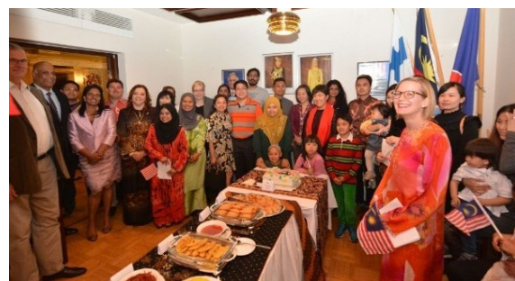
Ambassador Blanche Olbery and participants at the Merdeka & Malaysia Day High Tea at the Embassy of Malaysia on 13 September 2016

After a month of fasting for about 20 hours a day during Ramadhan, the Muslims in Finland observed the arrival of Syawal 1437 with the celebration of Aidilfitri.