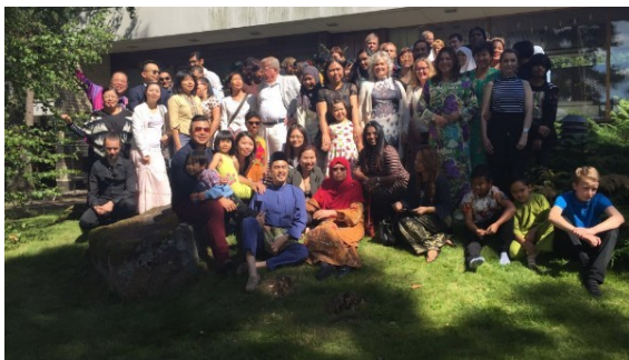
Group photo of participants at the Aidilfitri Hari Raya Open House at Rumah Malaysia on 9 July 2016

In the third quarter (July–September 2016) the Embassy's activities included, among others, community events with Malaysians in Finland, diplomatic events such as collaboration with fellow ASEAN colleagues and a luncheon with the Women Ambassadors' network, as well as visitors from Malaysia. Read more about our activities in this section.