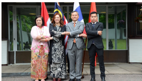
Solidarity among the Helsinki-based ASEAN Ambassadors (Indonesia, Malaysia, Thailand) and Chargé d'affaires (Vietnam) at the Flag Hoisting ceremony on 8 August 2016