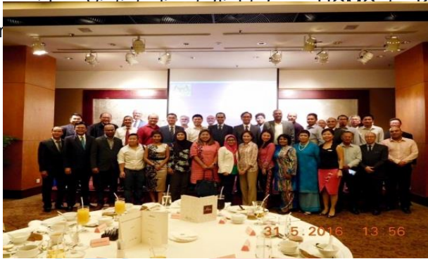
Welcoming lunch jointly hosted by the Consulate General and MBC - Meeting Malaysians in HCMC