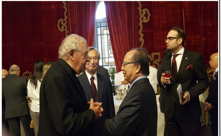
National Day of Spain on 12 October 2016