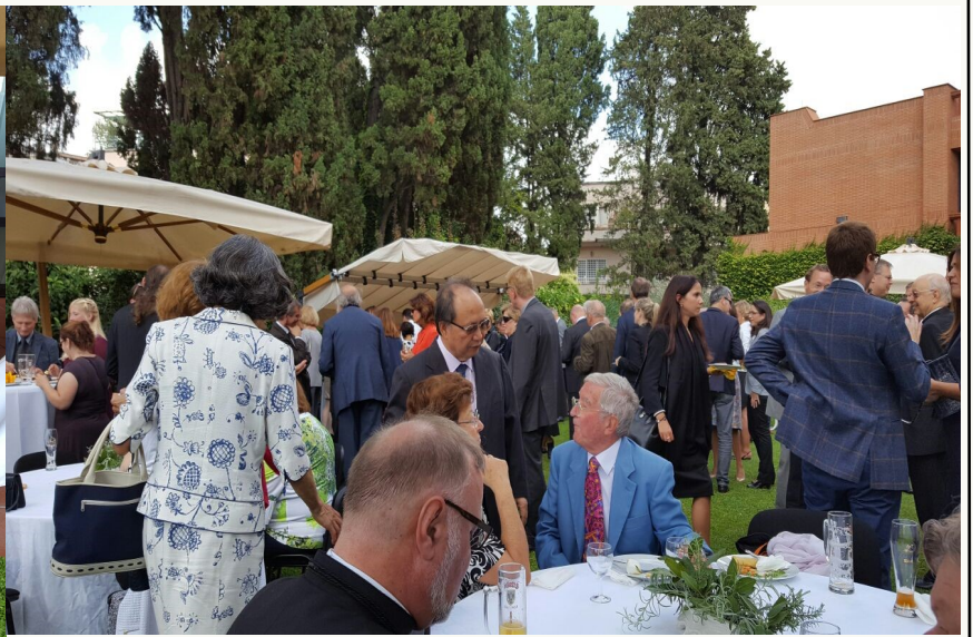
October Fest on 3 October 2016 by the Embassy of Germany

EMBASSY OF MALAYSIA TO THE HOLY SEE Ambasciatori Palace Hotel Suite 114, 115 and 116 Via Veneto, 62, 00187 Rome, Italy