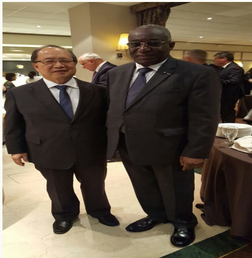
National Day of Ivory Coast on 29 September 2016