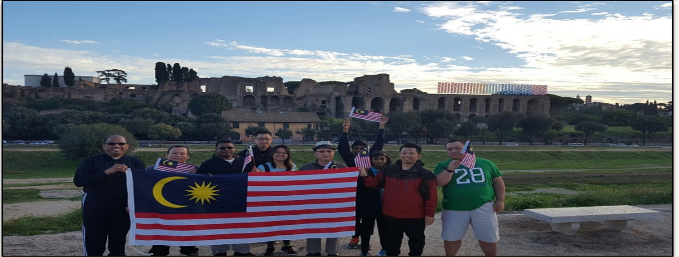
Permulaan Acara di Pizza Le. Ugo La Malfa (depan Roman Forum)

Kedutaan Besar Malaysia ke Holy See telah meraikan Hari Sukan Negara 2016 peringkat Malawakil Holy See pada 8 Oktober 2016 di Rome, Itali. Ini merupakan kali pertama Kedutaan Besar Malaysia ke Holy See menganjurkan Hari Sukan Negara peringkat Perwakilan sejak penubuhannya pada 21 Mac 2016. Aktiviti sukan yang telah dipilih pada tahun ini ialah Brisk Walking .