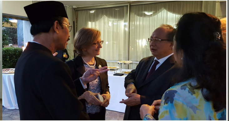
71st Anniversary of the Republic of Indonesia on 14 September 2016