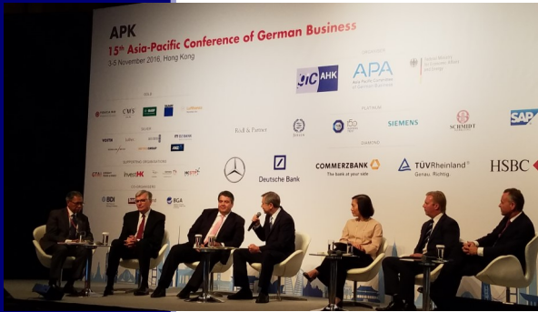
YB Dato' Sri Mustapa Mohamed at the far left of the picture.

YB Dato' Sri Mustapa Mohamed, Minister of International Trade and Industry was invited as a panelist for a discussion on