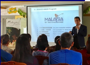
MM2H briefing by Aubella MM2H at Malaysia Building Penthouse

The Malaysia My Second Home (MM2H) Programme is an international residency scheme that allows foreigners who fulfil certain criteria to stay for long term in Malaysia on a multiple-entry social visit pass. The Social Visit Pass is valid for an initial period