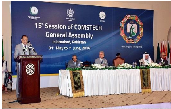
PRESIDENT MAMNOON HUSSAIN ADDRESSING THE 15TH INAUGURAL SESSION OF GENERAL ASSEMBLY OF COMSTECH IN ISLAMABAD ON MAY 31, 2016.