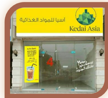
Umrah Visit by YB Dato' Seri Tajuddin Abdul Rahman, Deputy Minister of Agriculture and Agro Base Industry, 27 June-7 July 2016